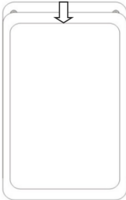
Picture 5.1 Top cover opening instructions