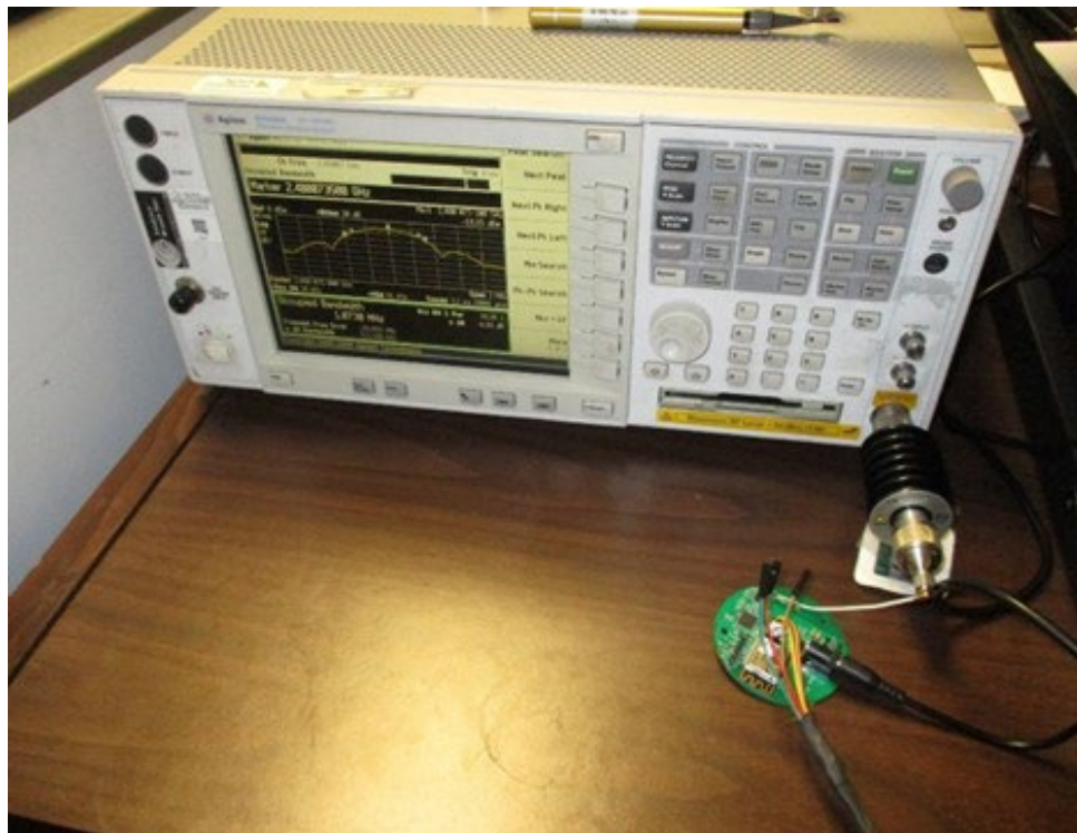
Duty Cycle, OBW, Output Power, PSD, Conducted Spurious, Band Edge