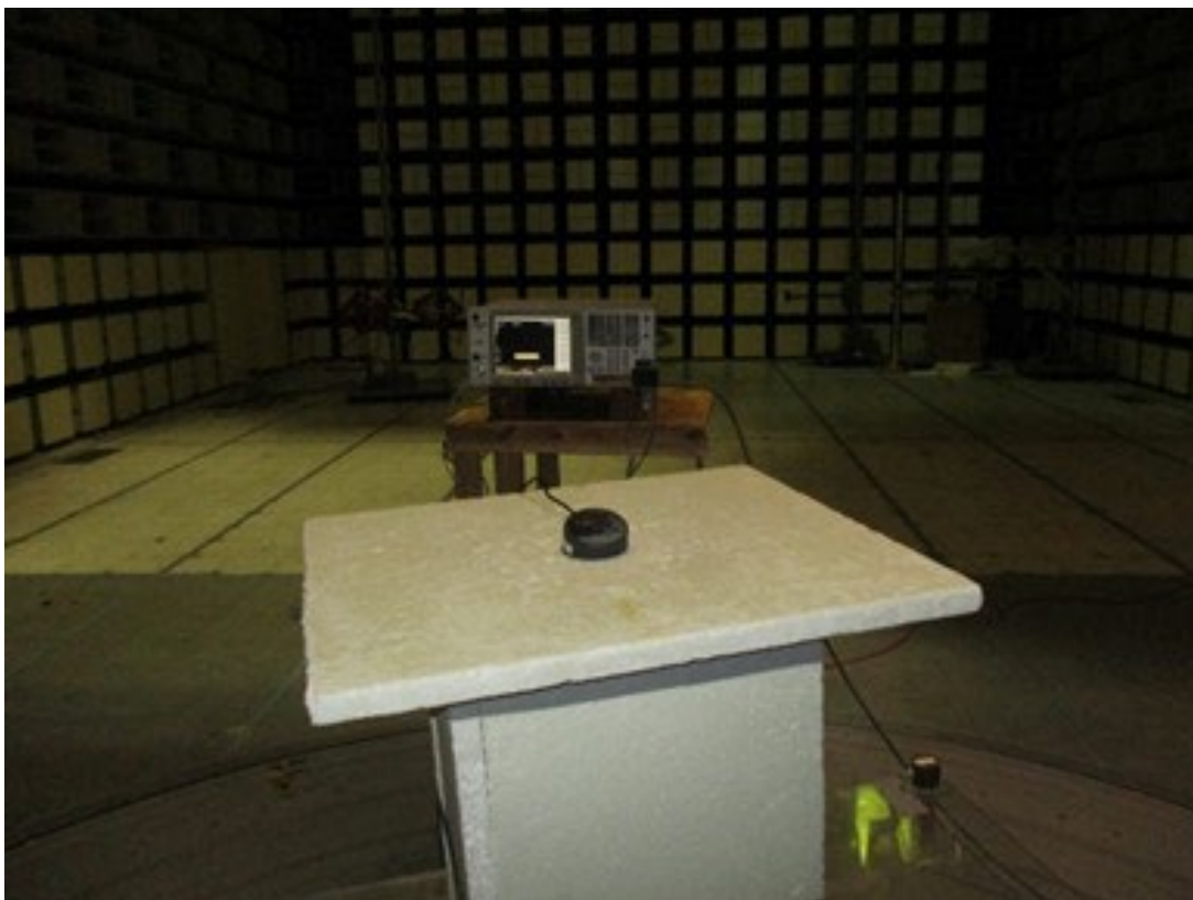
Radiated Emissions, 18GHz to 26.5GHz