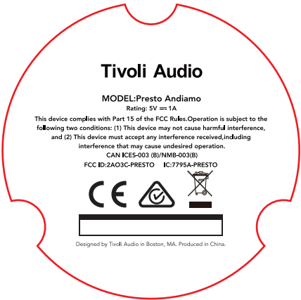
Label on the back of the product