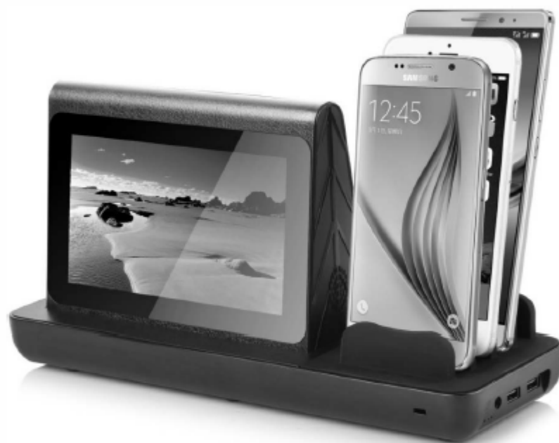
Table Advertising Player