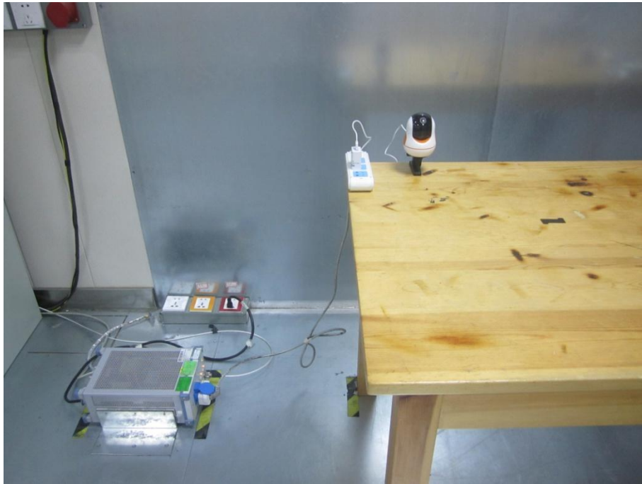
DTS radiation L