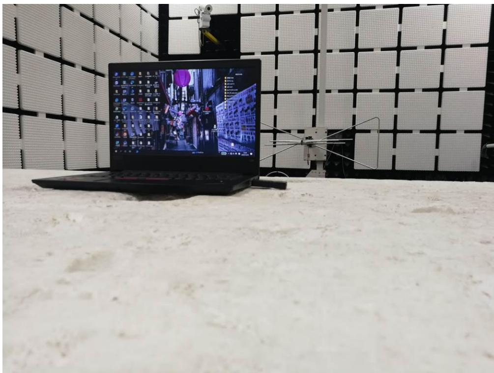
Fig.1(Photo of Radiated Measurement (30MHz~1GHz))