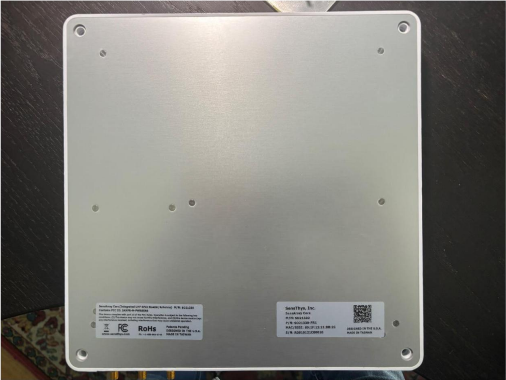
Figure 3 The locations of the labels on the reader.