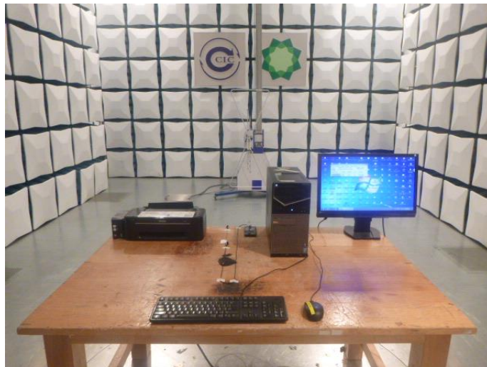
Radiated Emission (above 1GHz) Connect to PC