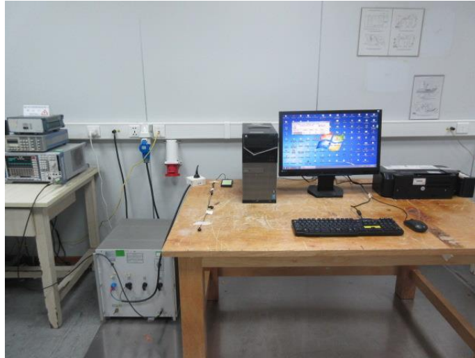
Radiated Emission (30MHz-1GHz) Connect to PC