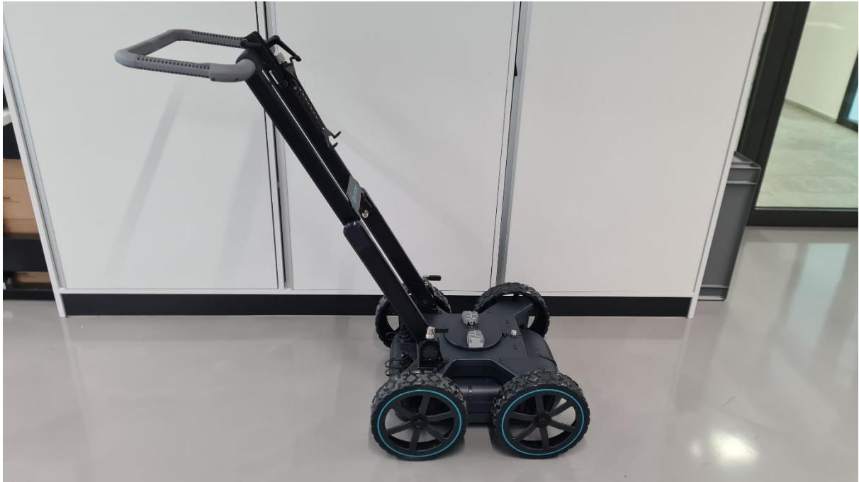
Figure 1: Side view