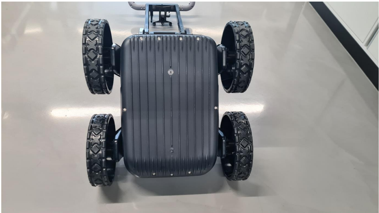
Figure 6: Bottom view