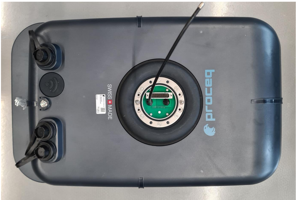
Figure 8: Label on Antenna