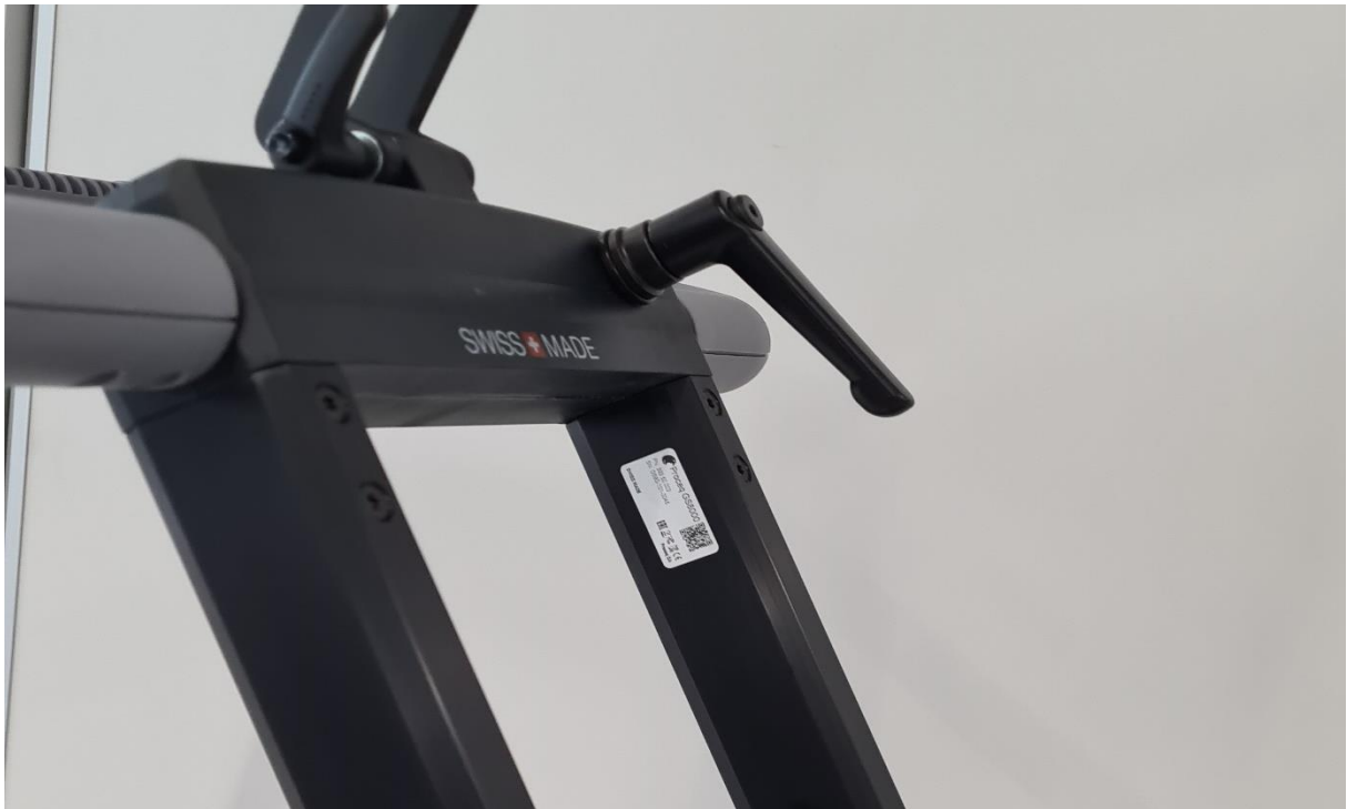
Figure 8: Label on Handle