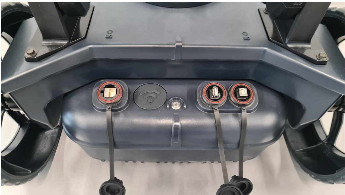
Figure 8: Connectors open.