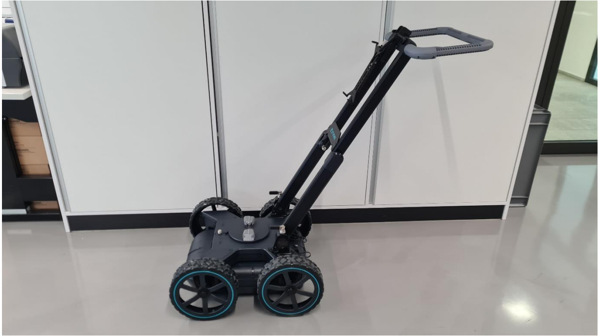
Figure 3: Side view