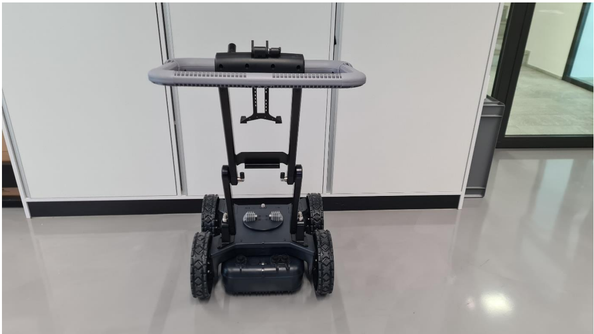
Figure 4: Back view