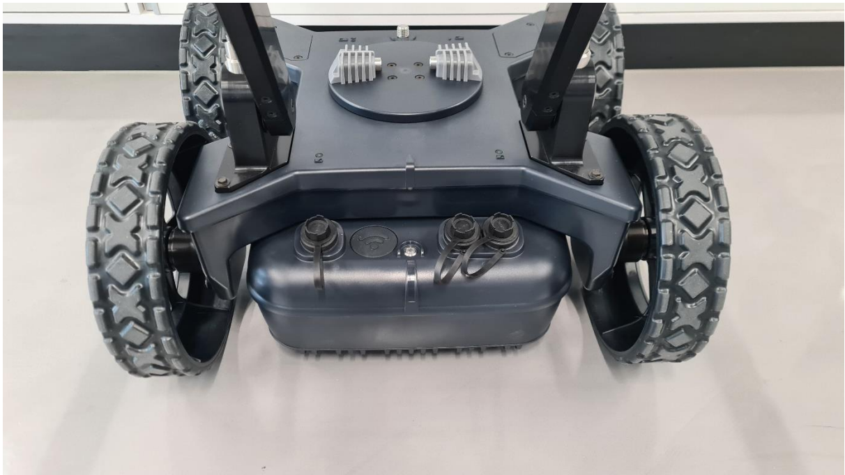
Figure 7: Connectors