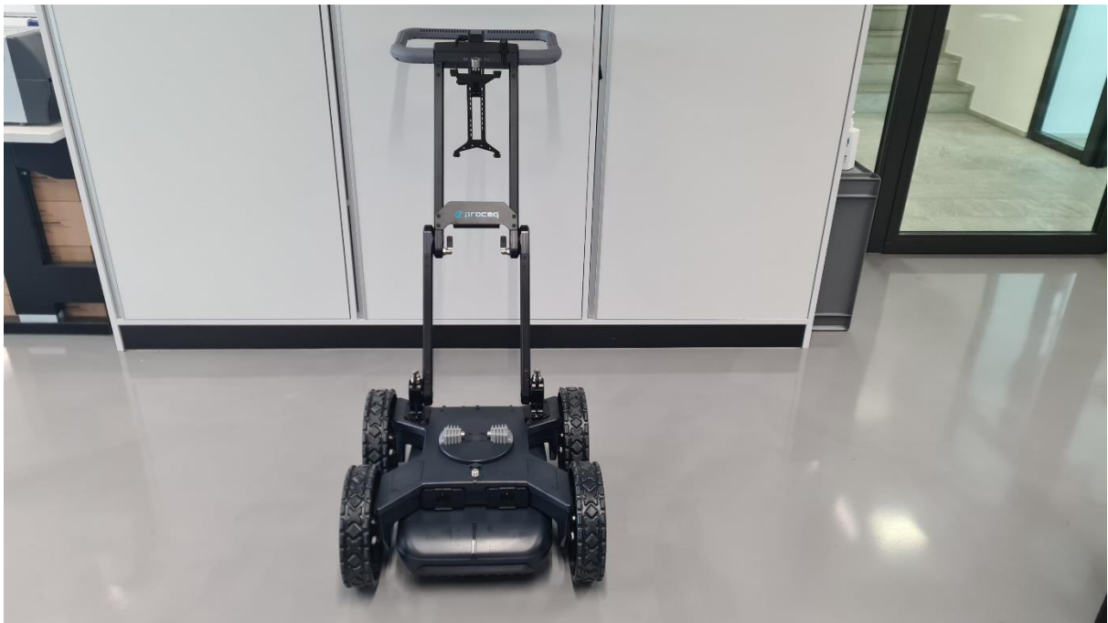
Figure 2: Front view