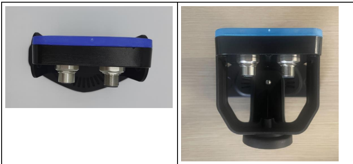
Figure 4: Top view with 2-axis rotating stirrup (on the left) and 3-axis rotation stirrup (on the right)