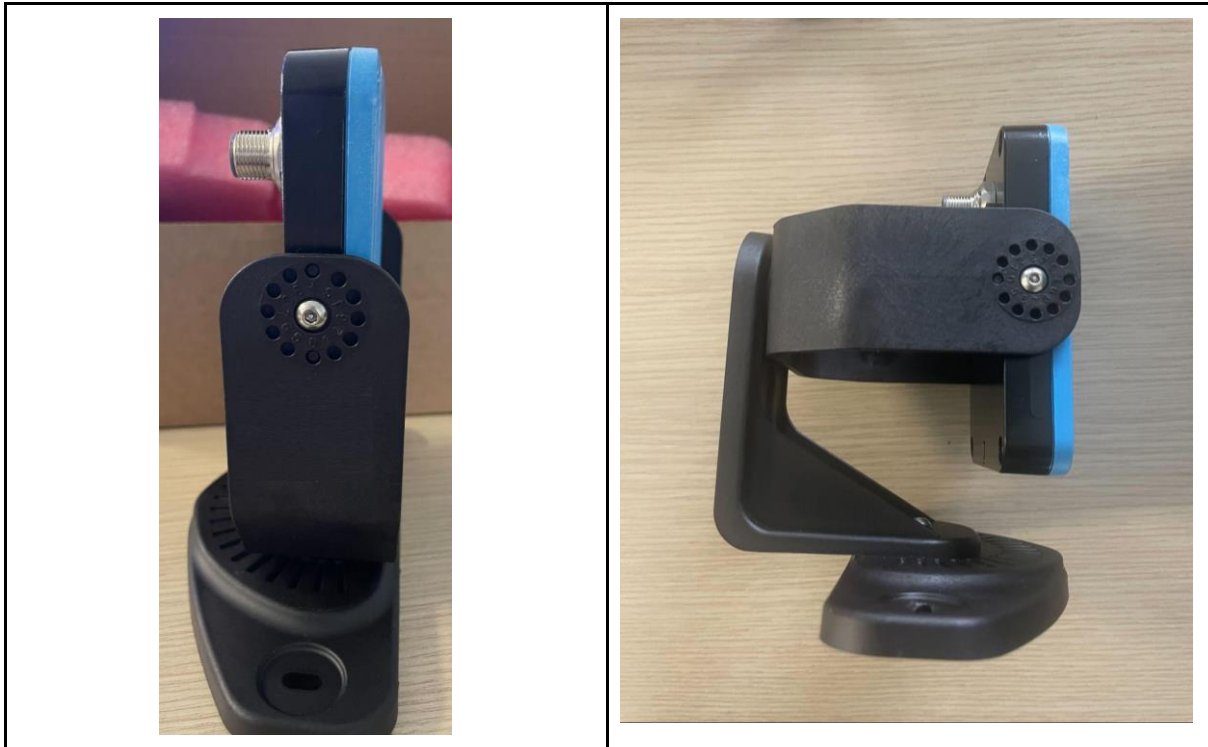
Figure 3: First side view with 2-axis rotating stirrup (on the left) and 3-axis rotation stirrup (on the right)