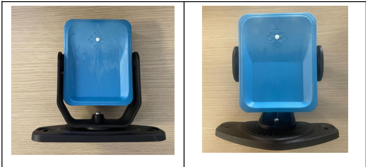
Figure 1: Front view with 2-axis rotating stirrup (on the left) and 3-axis rotation stirrup (on the right)