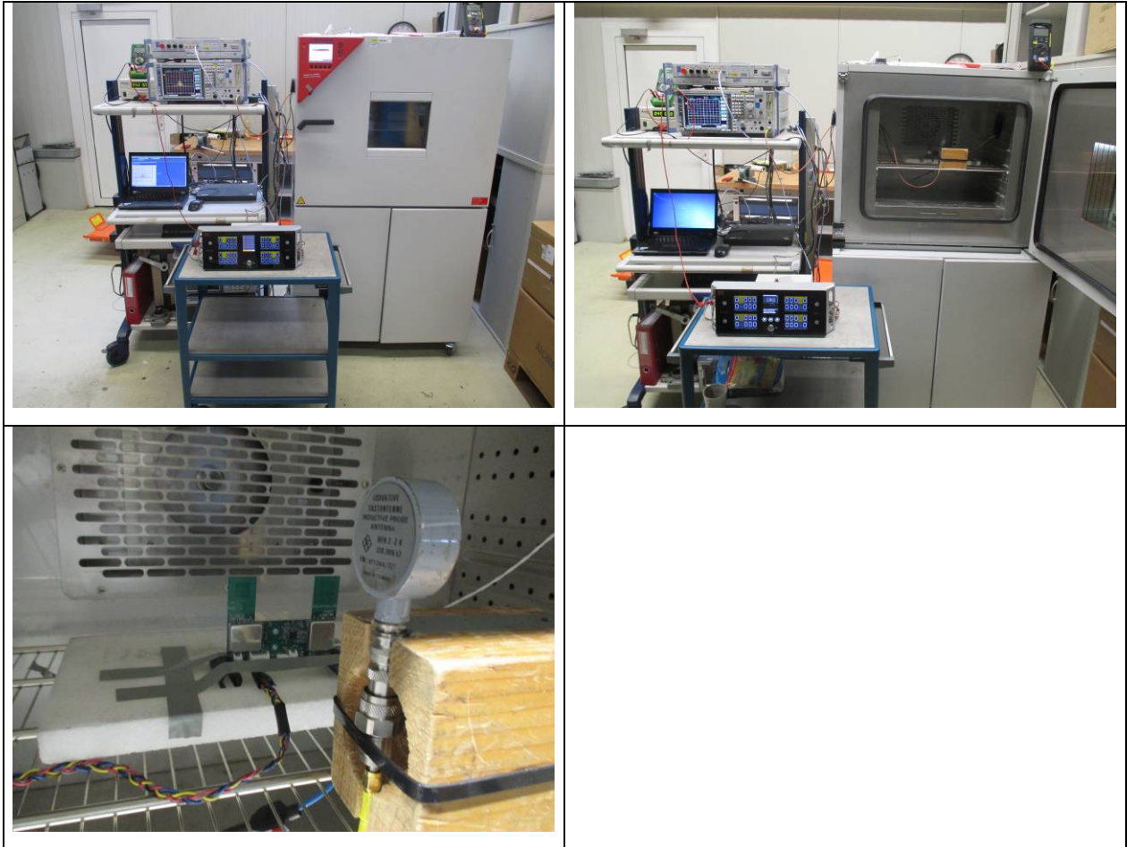
Figure 6: test setup for frequency stability – Configurations 1 & 2