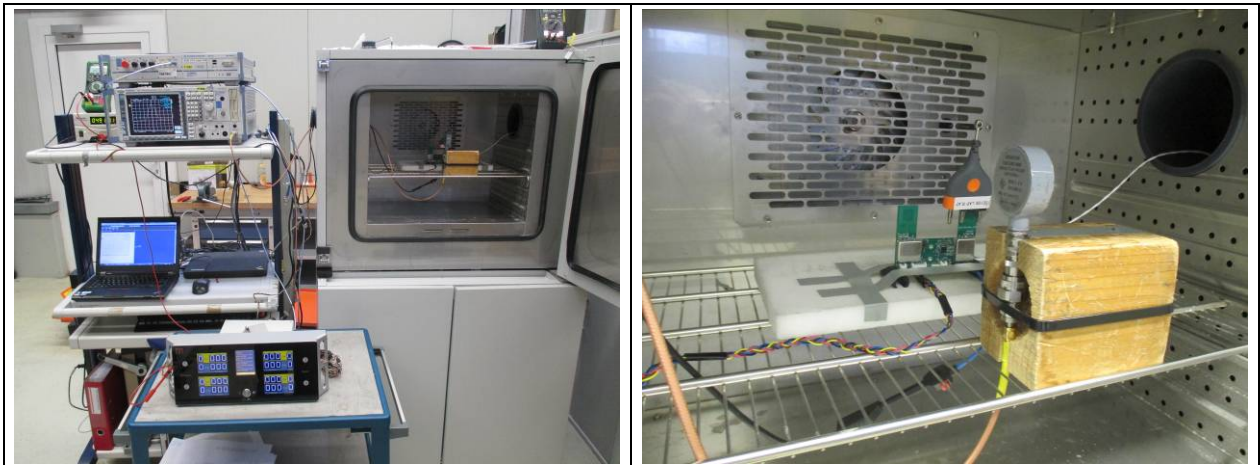
Figure 3: Test Setup Occupied Bandwidth – Configuration 6