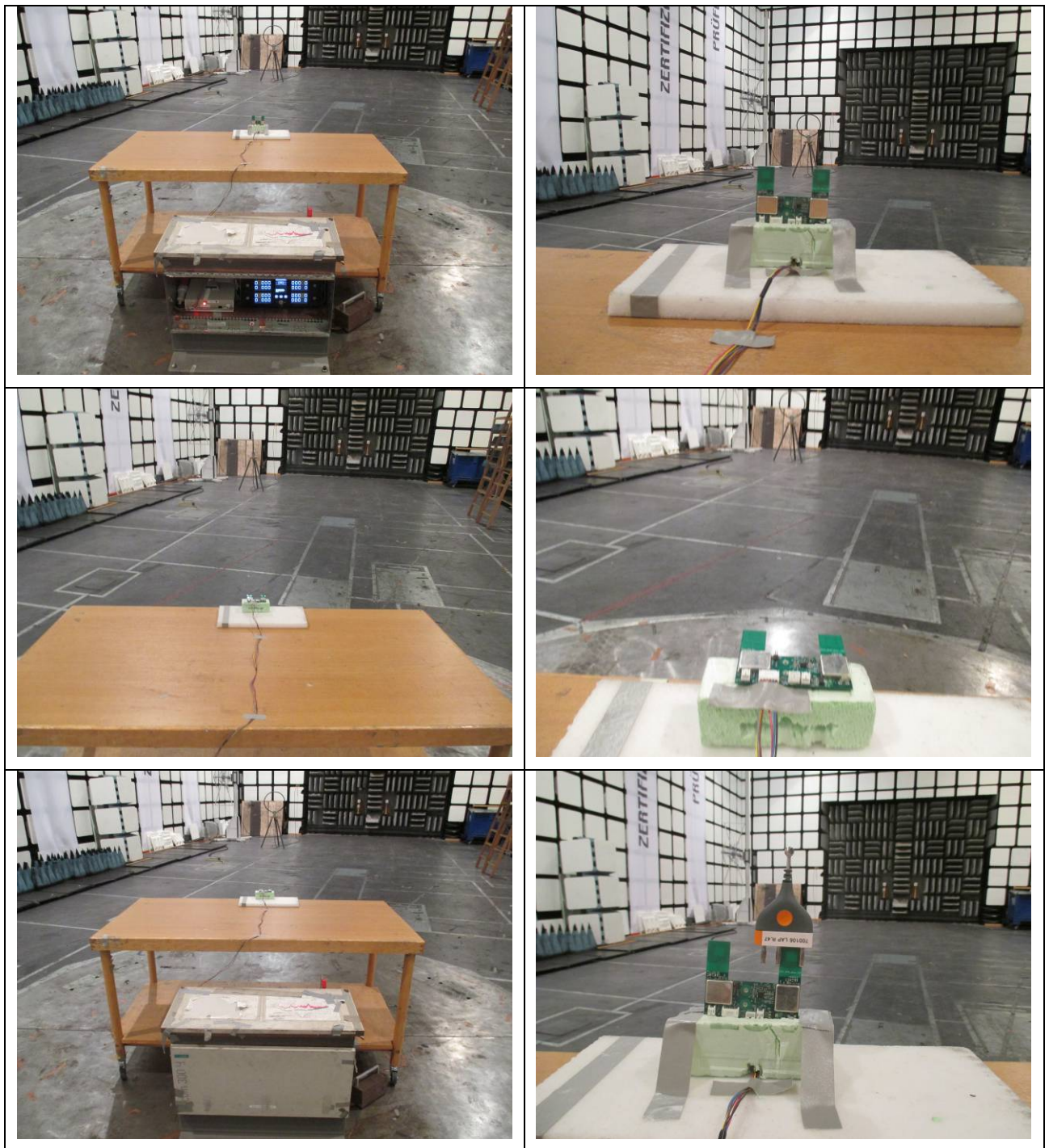
Figure 5: test setup for Radiated disturbances 9 kHz to 30 MHz – Configuration 1, 2, 3, 4, 5