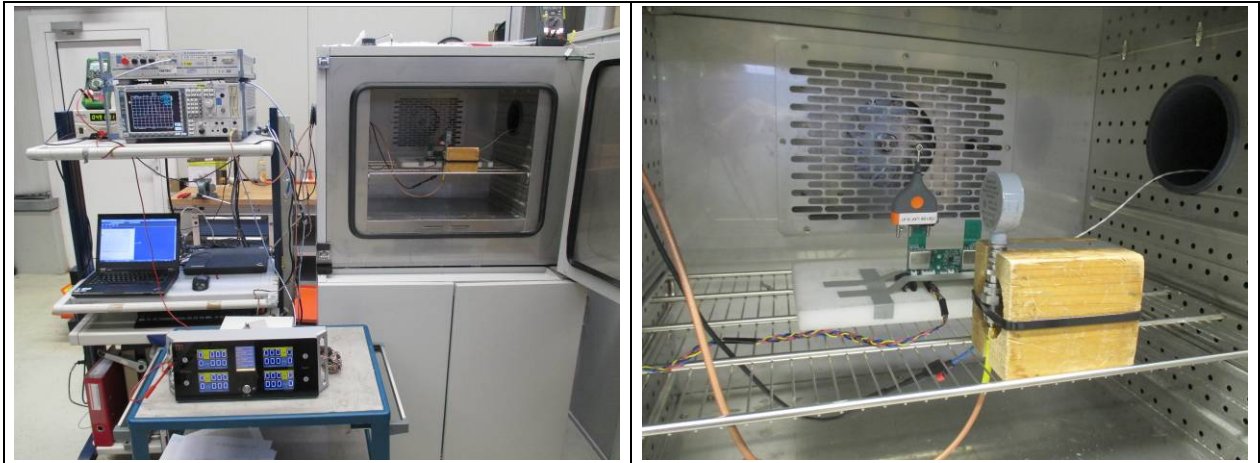
Figure 2: Test Setup Occupied Bandwidth – Configuration 5