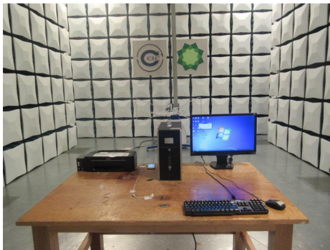
Radiated Emission (above 1GHz) Connect to PC