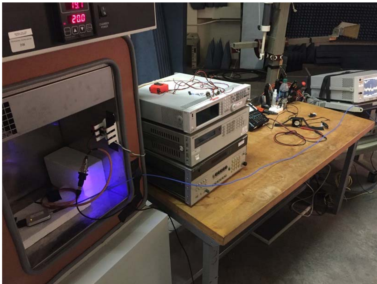
Frequency Stability 2