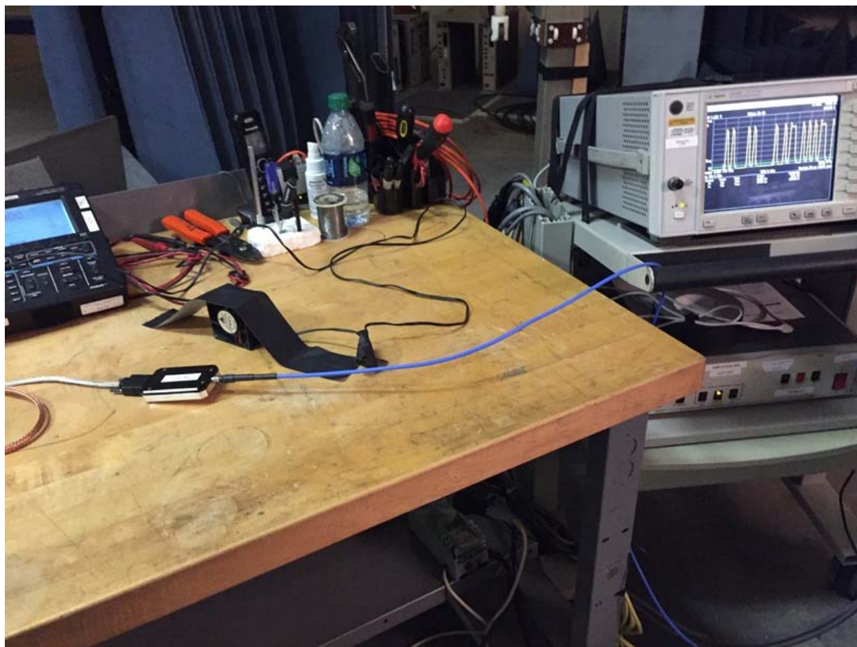
Conducted Antenna Port, Power, Modulation Characteristics, Spurious, Bandwidth