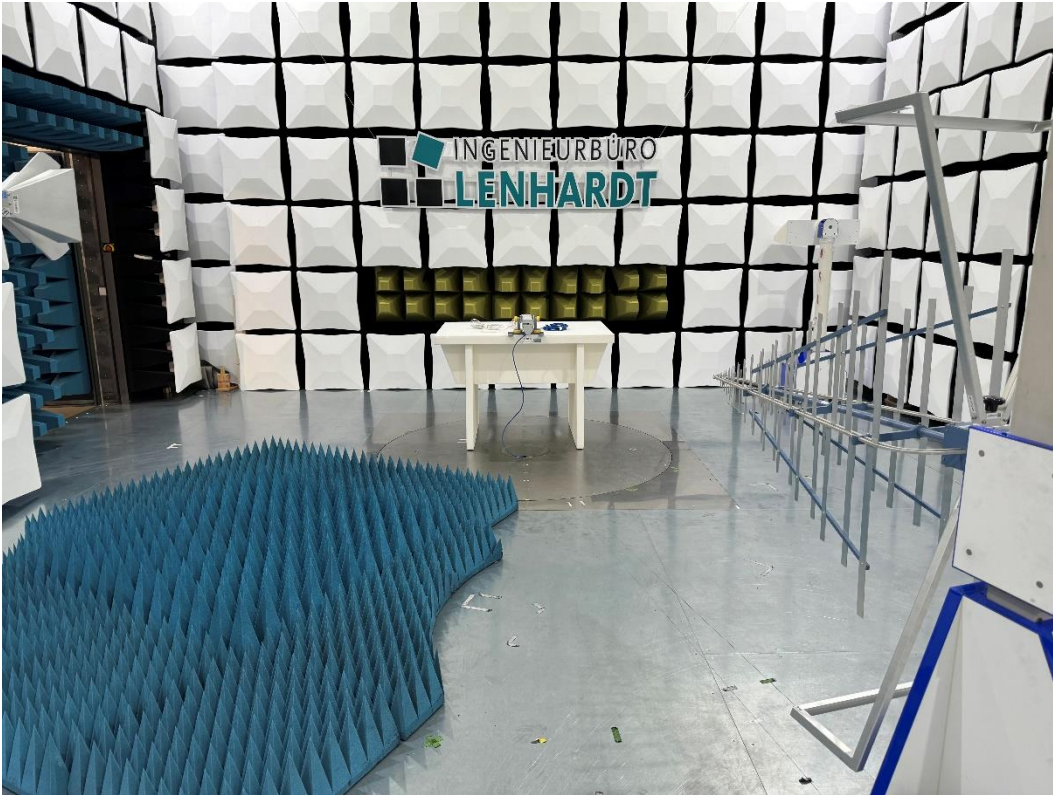
Photograph 4: Overall view.