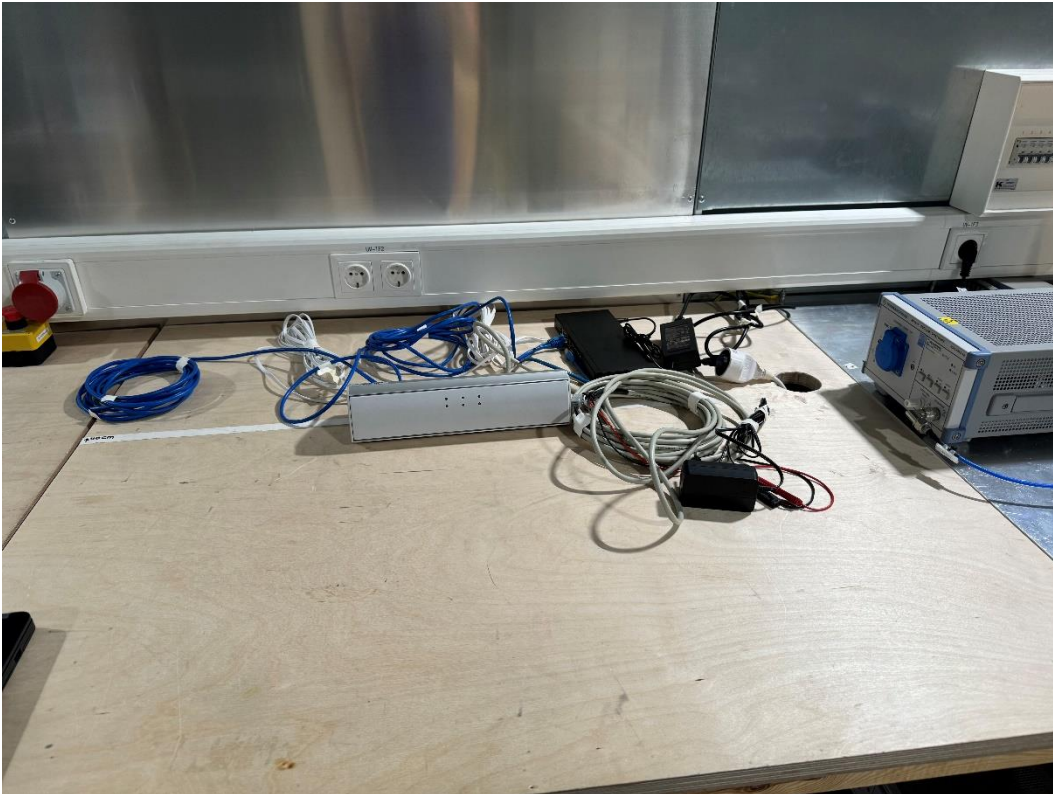
Photograph 9: Overall view, set-up 1.