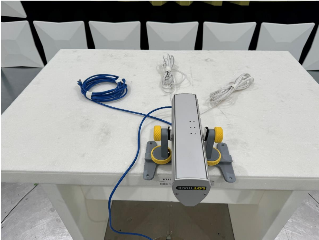
Photograph 3: Close view 2.