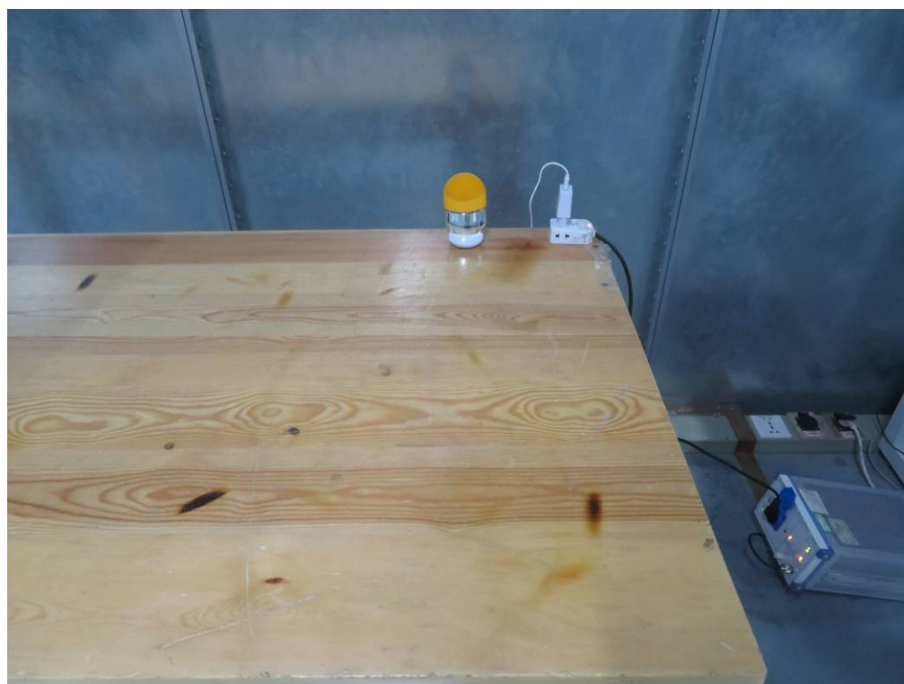
Photo of Power Line Conducted Emissions Measurement