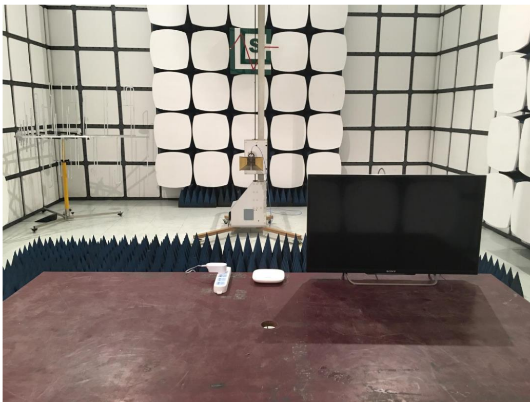
Radiated emission above 1GHz