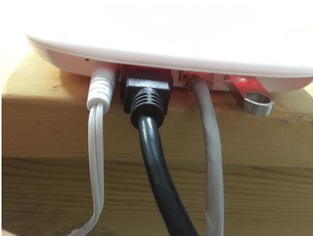
Conducted Emission( Zoom in rear view)