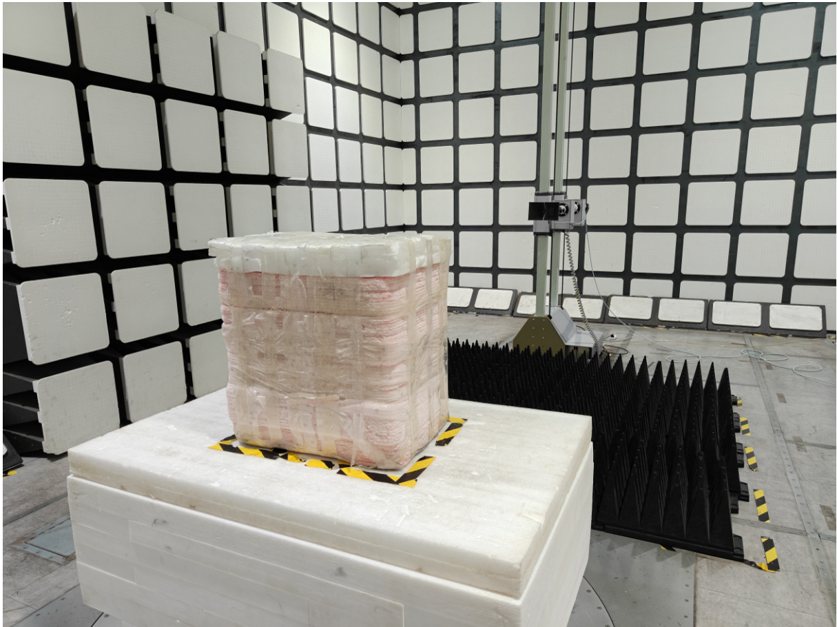
Radiated Emissions View (18-25 GHz)