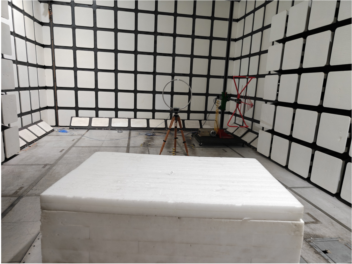
Radiated Emissions View (30 MHz- 1 GHz)