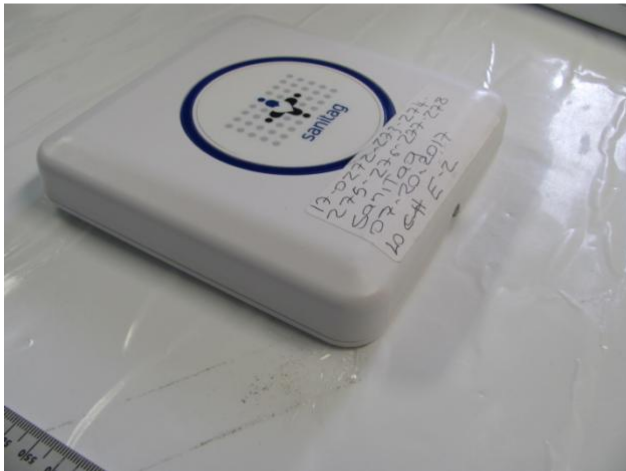
Figure 5. Sides 3 and 4

FCC Part 15 Certification 2AMOW-AR002HLR 17-0276 October 2, 2017 Sanitag Technologies Corp AR-002-HLR