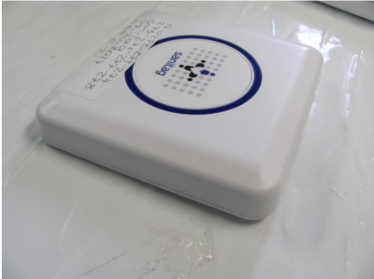
Figure 4. Sides 1 and 2

FCC Part 15 Certification 2AMOW-AR002HLR 17-0276 October 2, 2017 Sanitag Technologies Corp AR-002-HLR