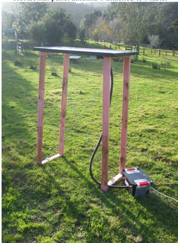
Horizontal panel antenna attached to Slave 1