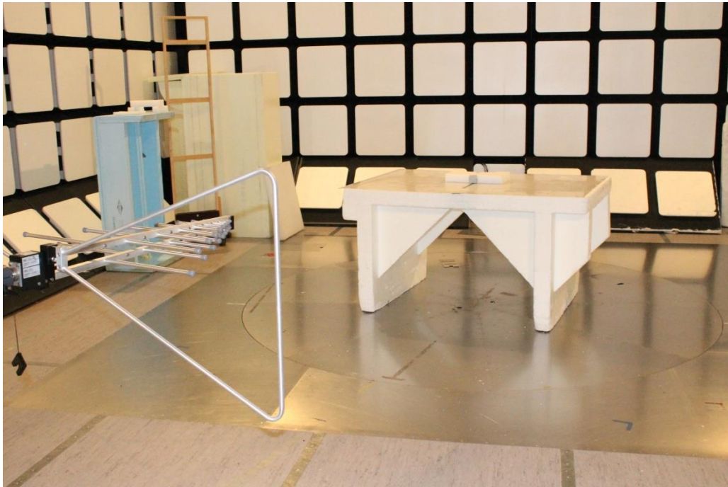
Photograph 1. Radiated Spurious Emissions 30 MHz - 1 GHz