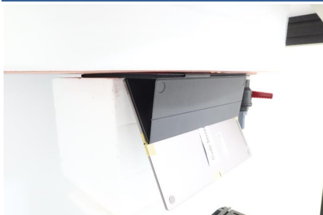
Bottom of Laptop at 0 mm