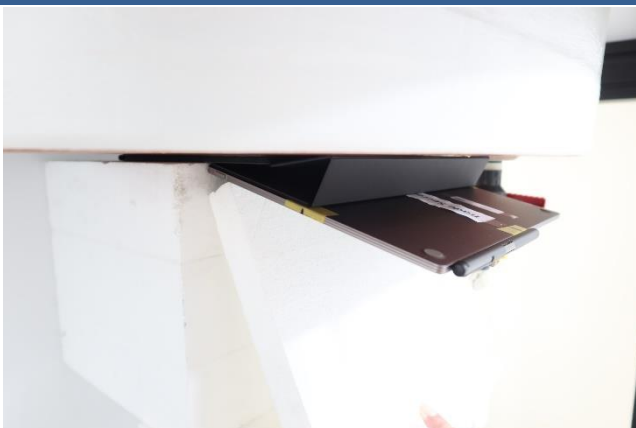
Bottom of Laptop(With WPT Pen) at 0 mm