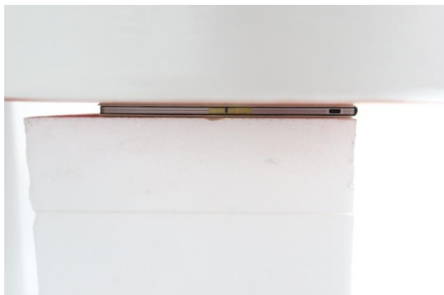
Bottom Face_Folding with Holster 2 (Fabric) at 0 mm