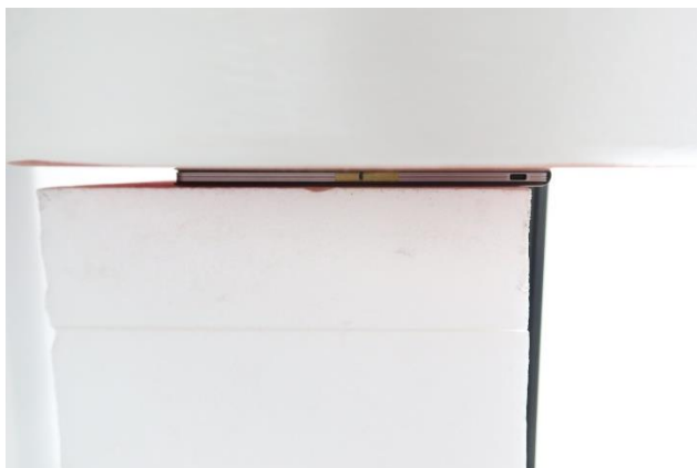
Bottom Face_Writing with Holster 1(Leather) at 0 mm