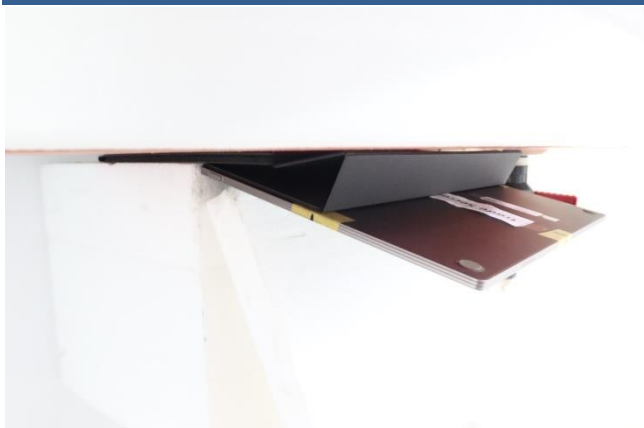
Bottom of Laptop at 0 mm