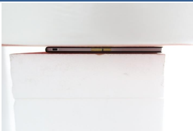
Bottom Face_Folding with Holster 1(Leather) at 0 mm