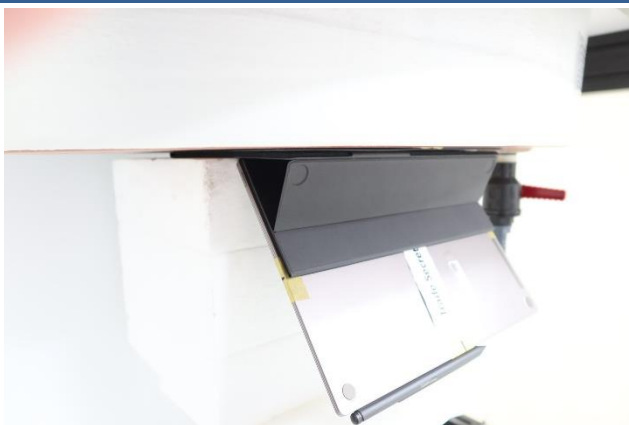
Bottom of Laptop(With WPT Pen) at 0 mm