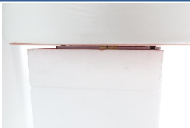
Bottom Face at 0 mm