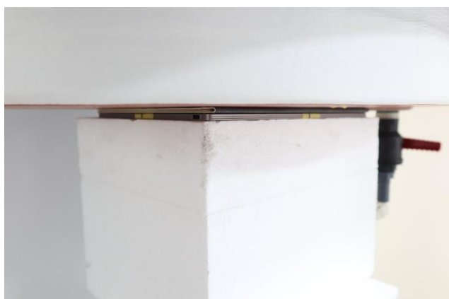
Bottom Face_Writing with Holster 2 (Fabric) at 0 mm