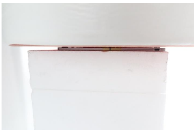
Bottom Face(With WPT Pen) at 0 mm