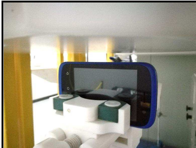
Left Side of EUT with 1.0 cm Gap