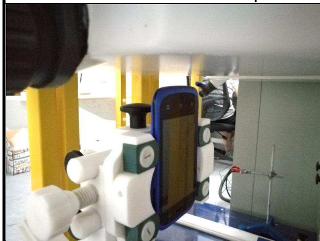
Bottom Side of EUT with 1.0 cm Gap