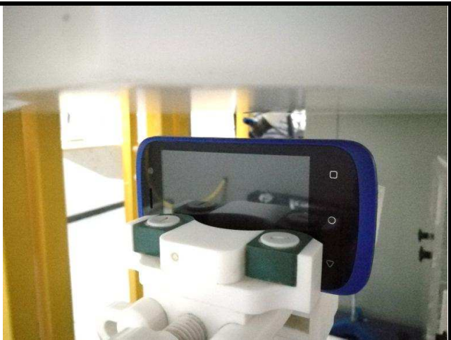
Right Side of EUT with 1.0 cm Gap