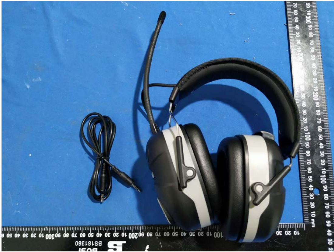
EXHIBIT B - EUT EXTERNAL PHOTOGRAPHS