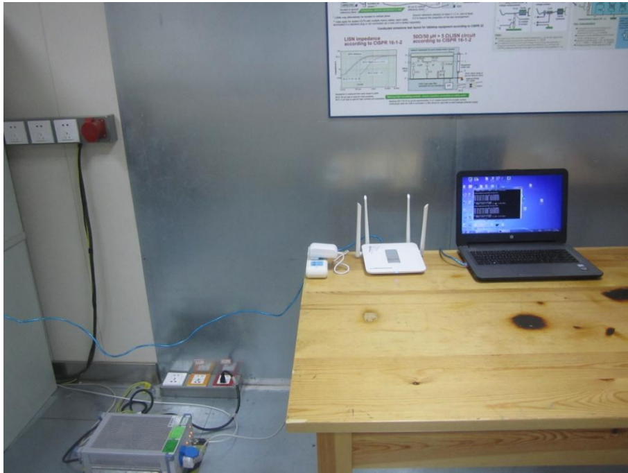
NII radiation L