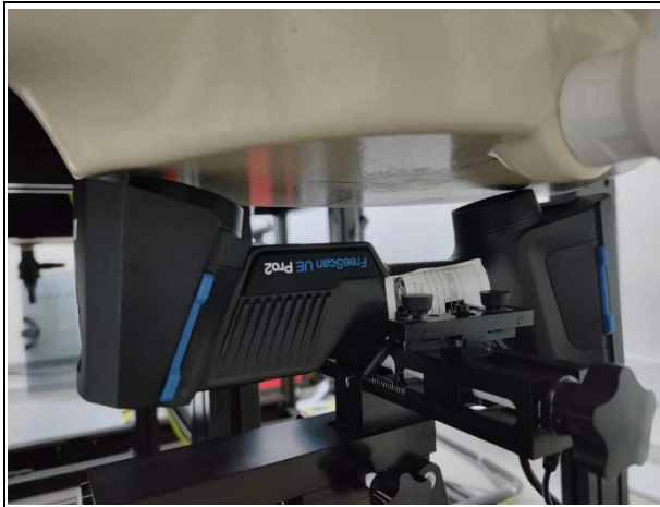
Figure 1.1-1 Front side 0mm

According to the antenna position, the Body SAR is tested at the following 5 test positions all with the distance =0mm between the EUT and the phantom bottom: