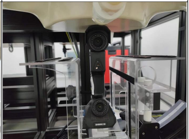
Figure 1.1-4 Top side 0mm