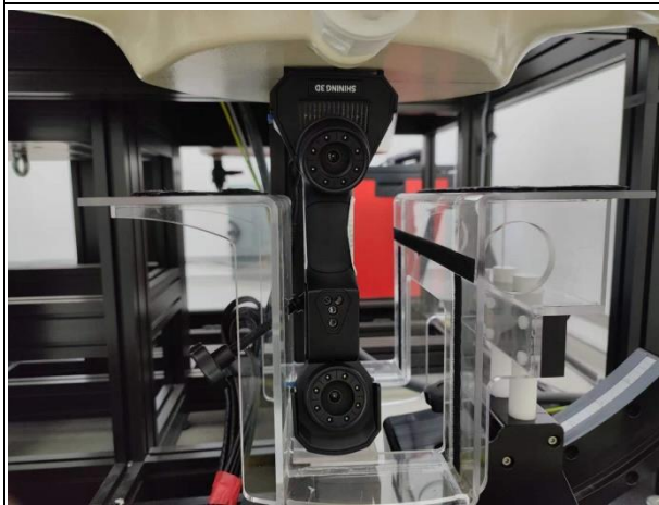
Figure 1.1-5 Bottom side 0mm