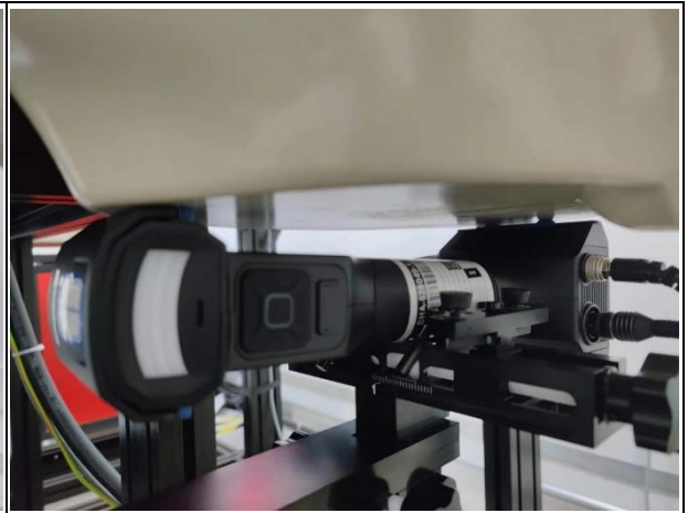
Figure 1.1-2 Left side 0mm