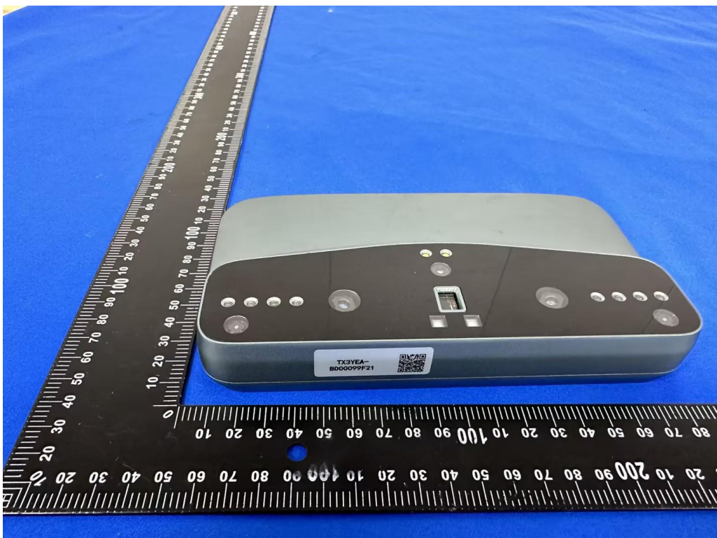
External View 6