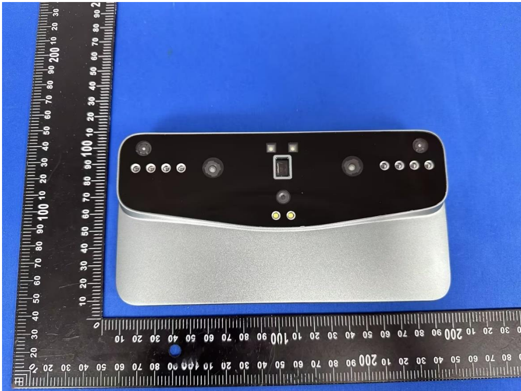
External View 1