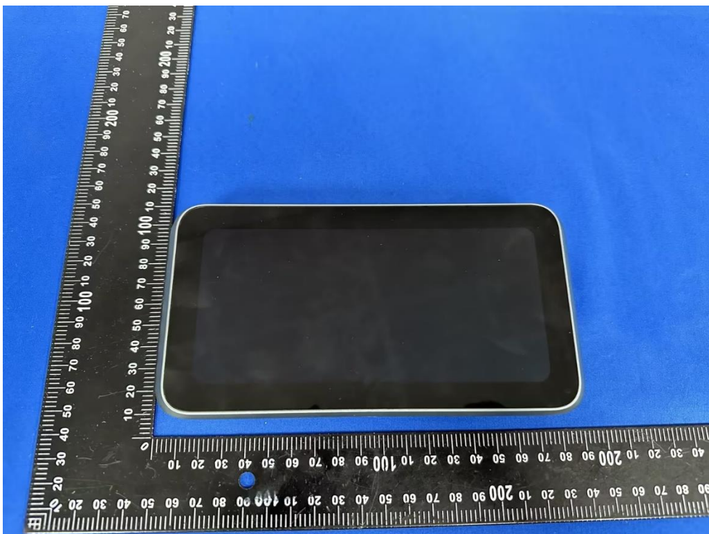
External View 2