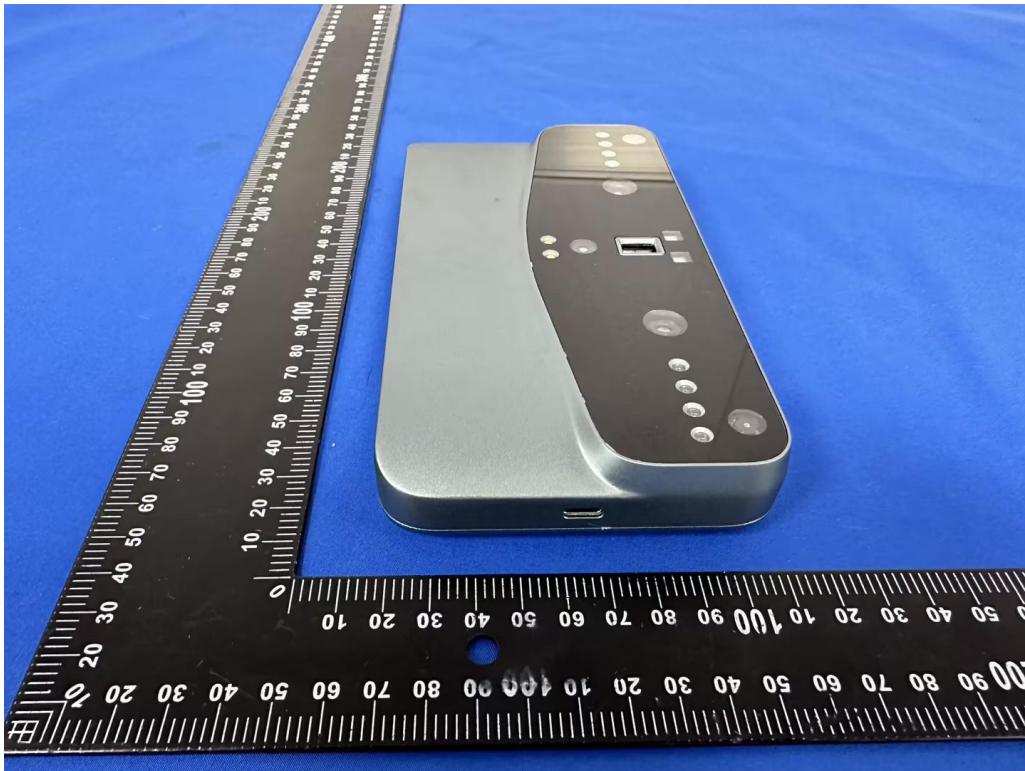
External View 3