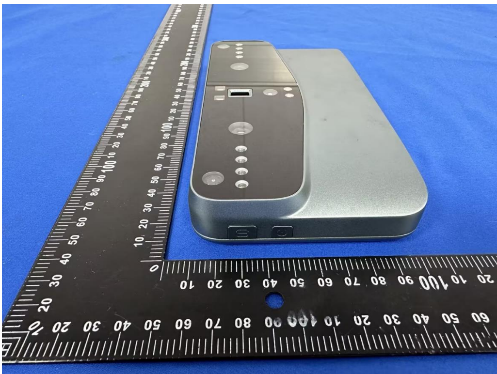
External View 4