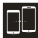
Three party call