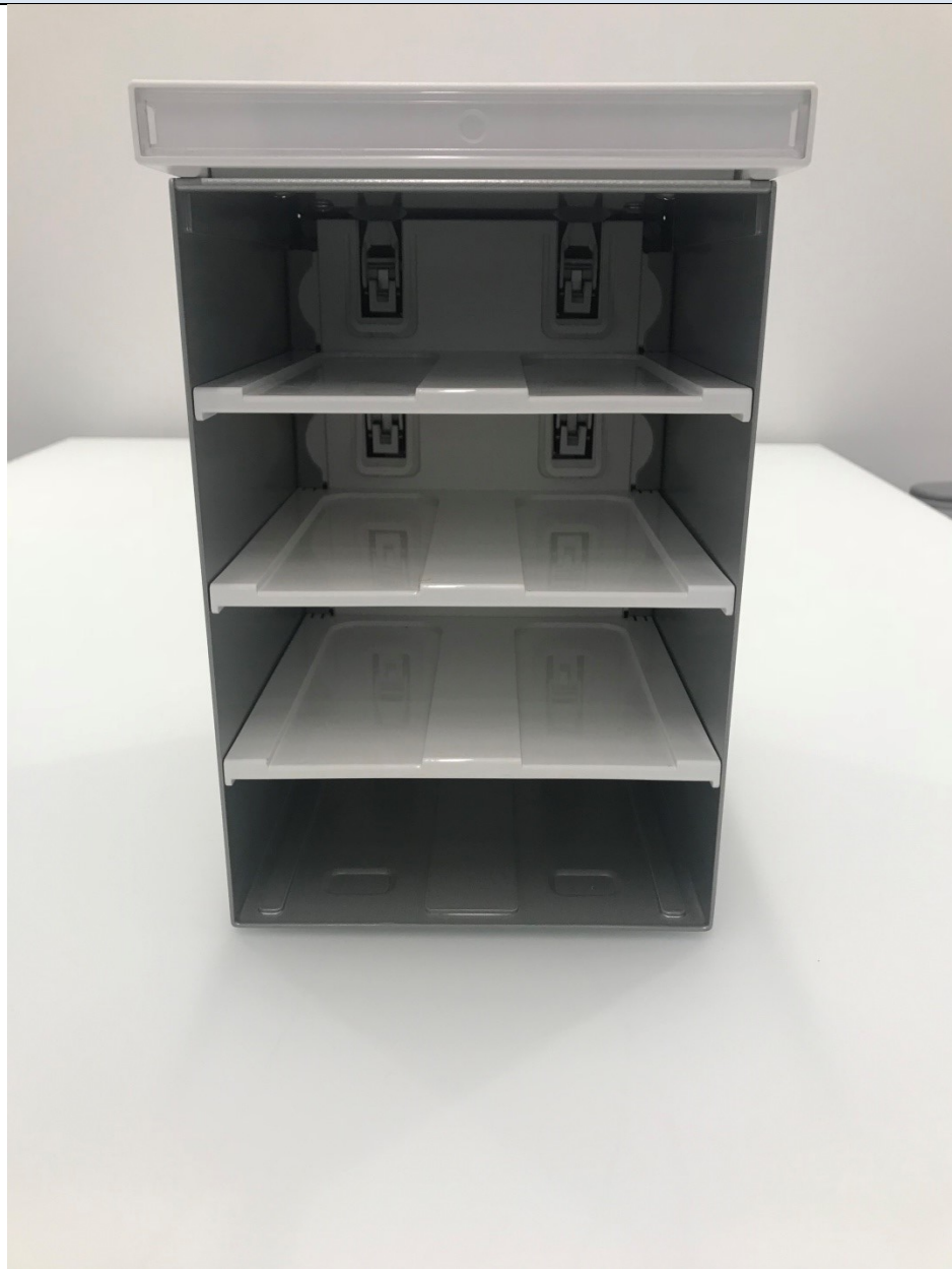
MedLink Cassette – Front