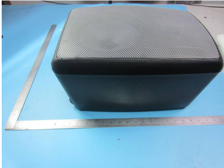
LEFT VIEW OF SAMPLE