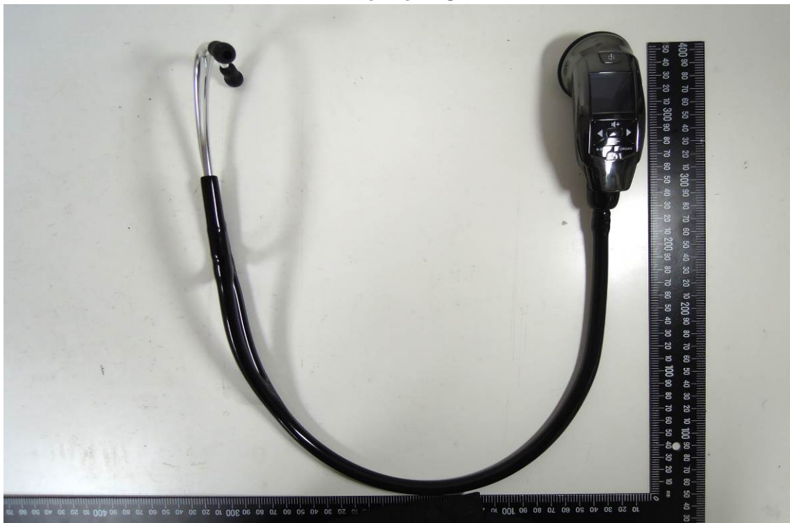
All View of EUT-2