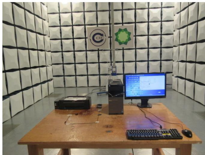
Radiated Emission (above 1GHz) Connect to PC