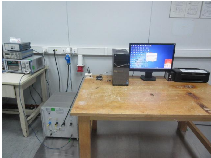
Radiated Emission (30MHz-1GHz) Connect to PC