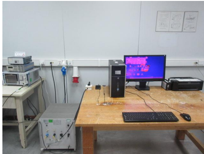
Radiated Emission (30MHz-1GHz) Connect to PC