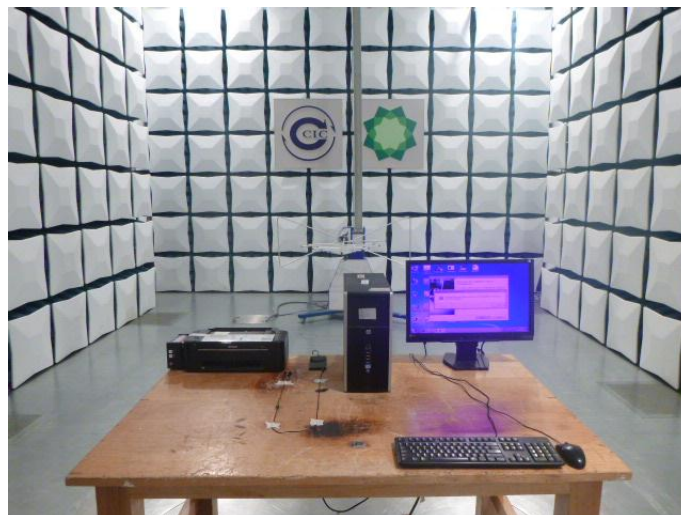
Radiated Emission (above 1GHz) Connect to PC