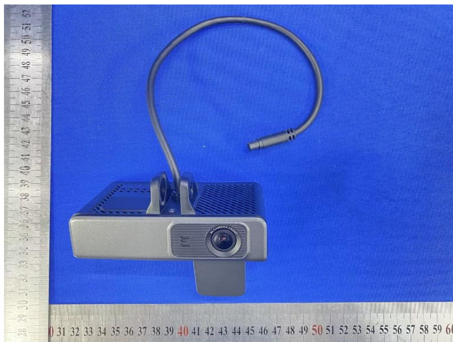
View of Product-07