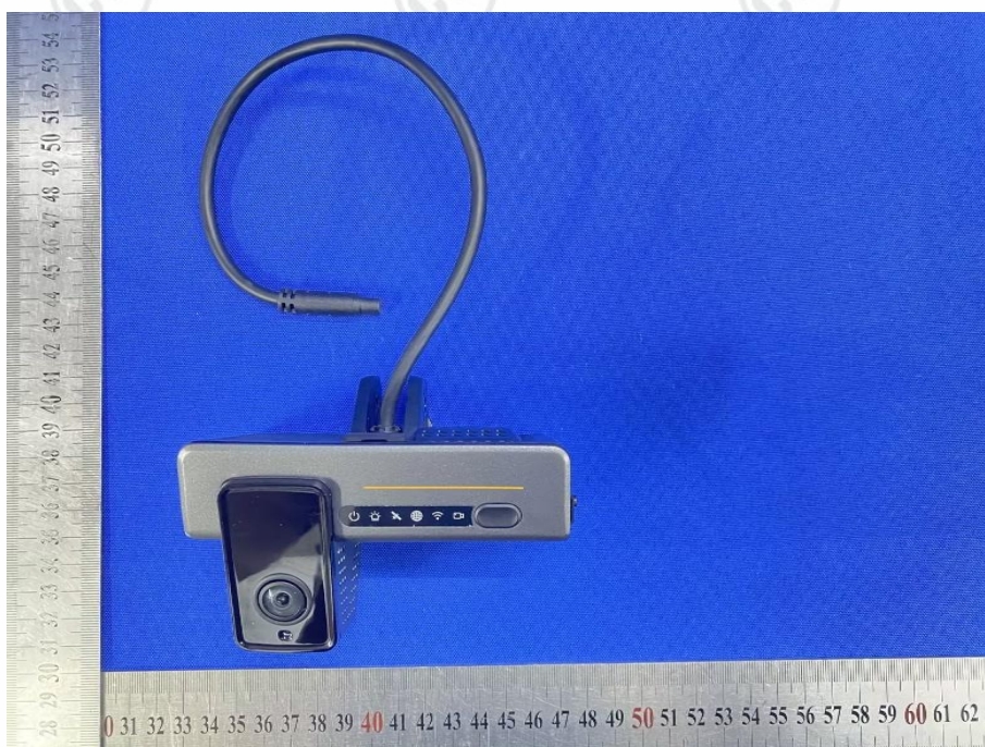
View of Product-02