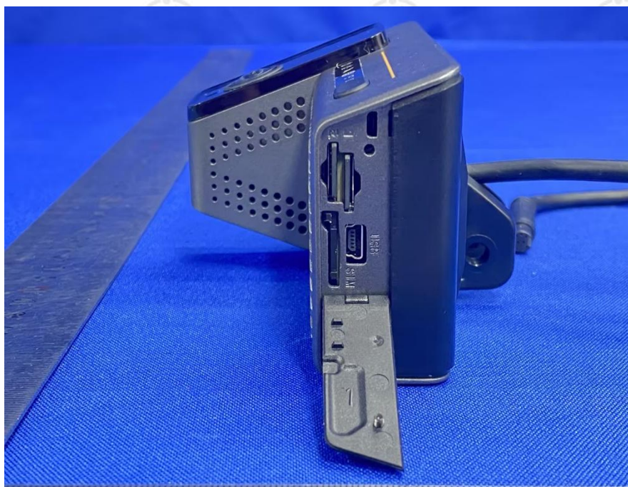
View of Product-08