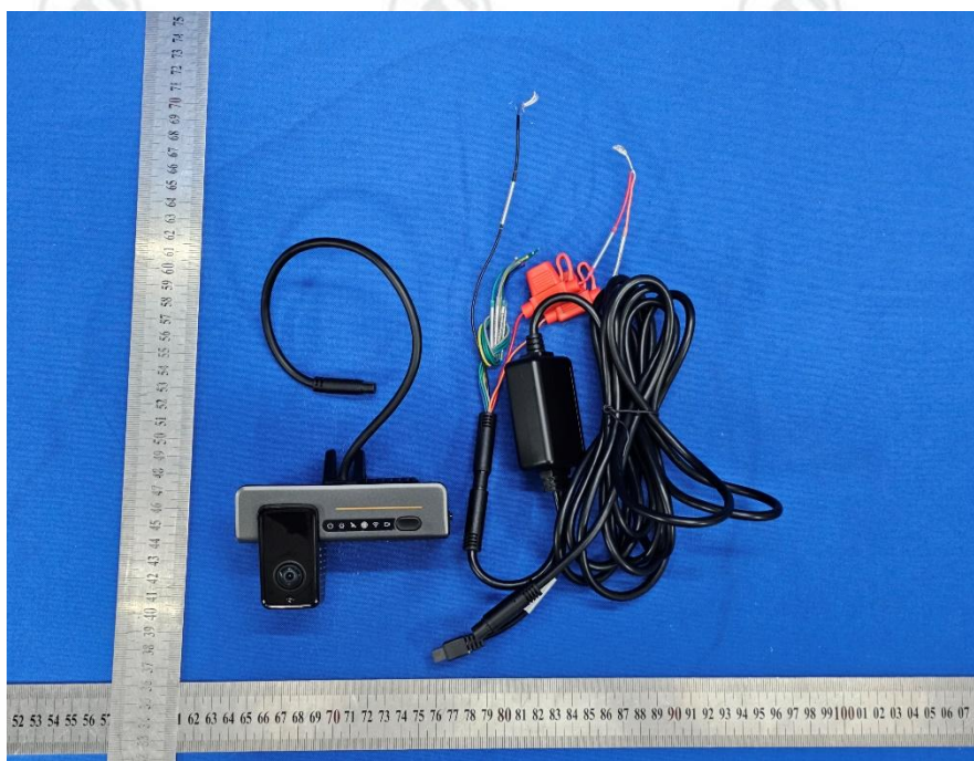
View of Product-01