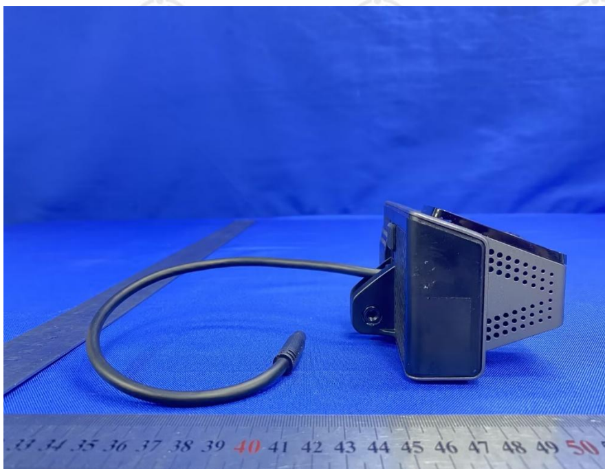
View of Product-06