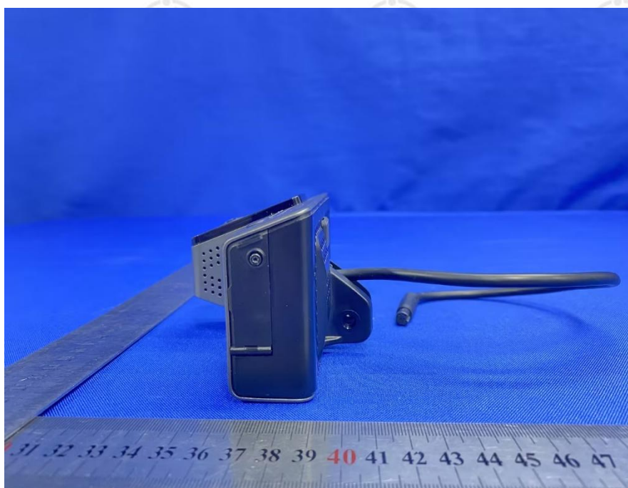
View of Product-04