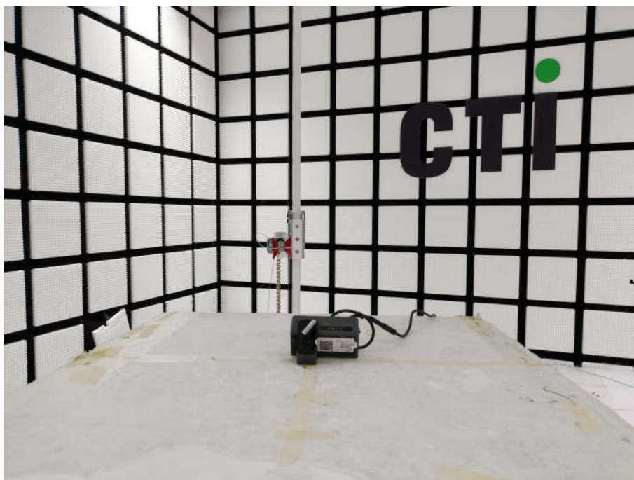
Radiated spurious emission Test Setup-2(Above 1GHz)