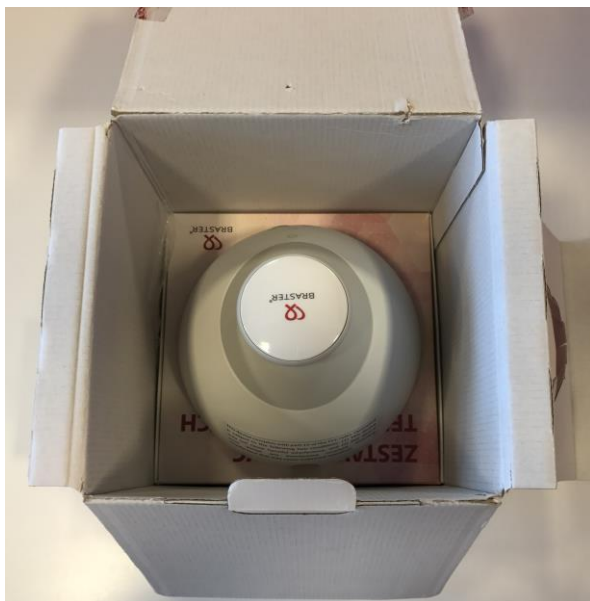
Fig. 3 Device into a shipping box