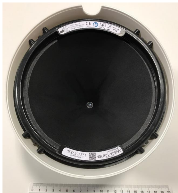
Fig. 4 Label location