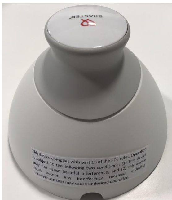
Fig. 5 FCC required statement

FCC ID is shown on the device label which is accessible after moving out the device from a shipping box. Braster device is delivered without an assembled matrix. During the device usage, a user can look at the device label after removing the thermographic matrix in easily way. Besides, a user manual contains clear explanation where the user can find the device label. Moreover on the shipping box there is the FCC ID.