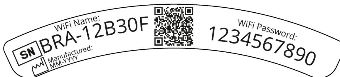
Fig. 2 Wi-Fi label