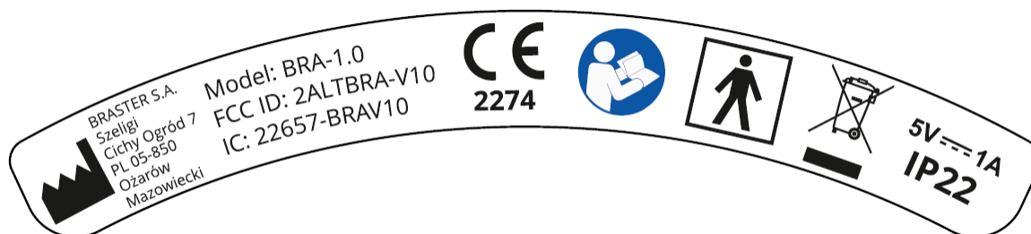
Fig. 1 Identification label