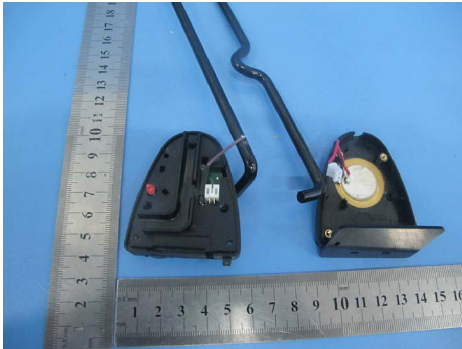
Photo 6 Appearance of PCB