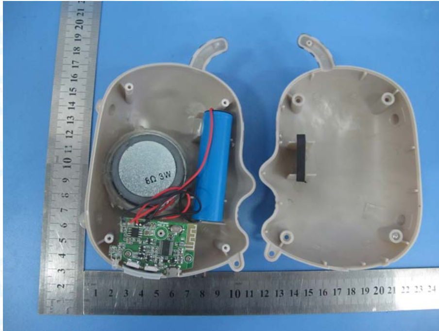
Photo 8 Appearance of PCB