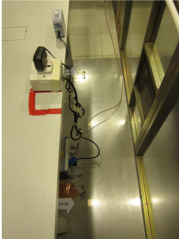
Side View 2