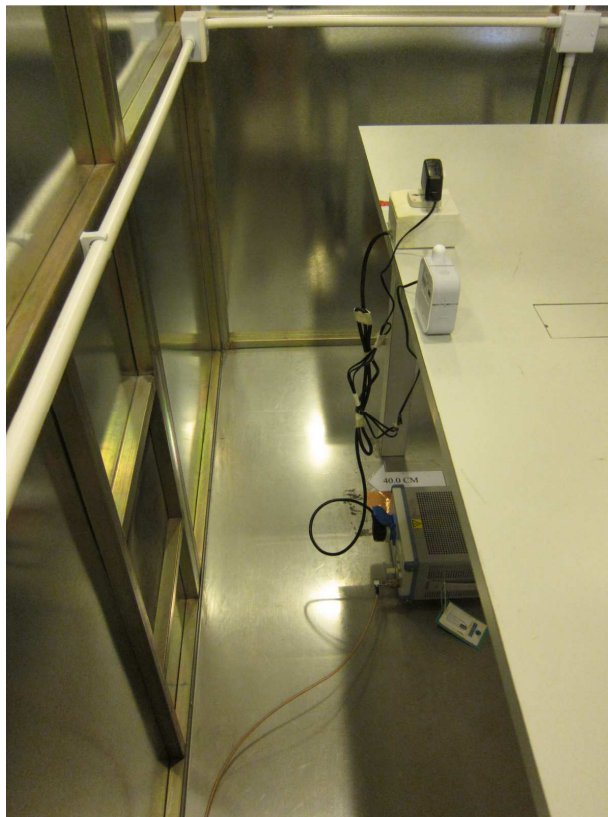
Side View 1

Test Report Number: 17010125HKG-002 FCC ID: 2ALJYBEA0505P IC: 22540-BEA0505P