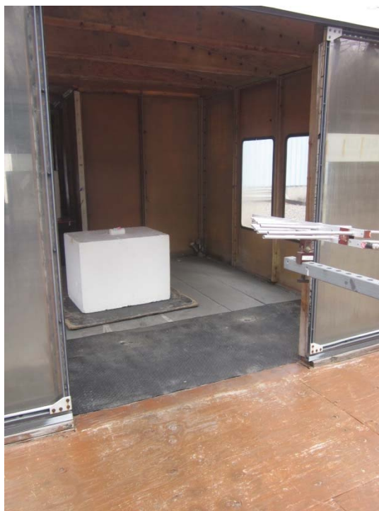
Horizontal Antenna Polarization, 200 MHz to 1 GHz, Log Periodic Antenna