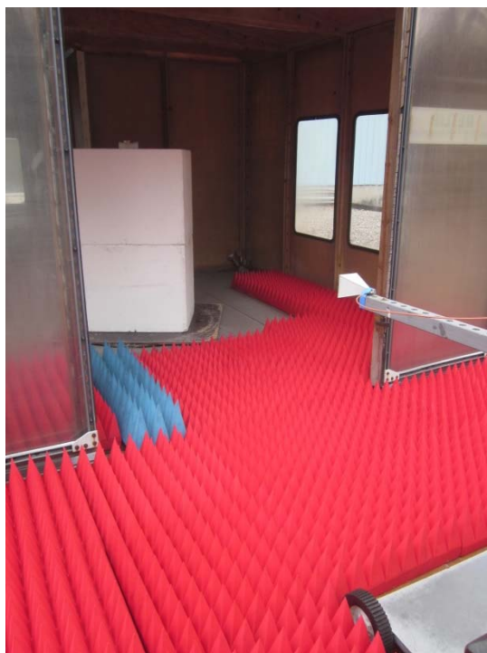
Horizontal Antenna Polarization, 18 GHz to 25 GHz, Horn Antenna