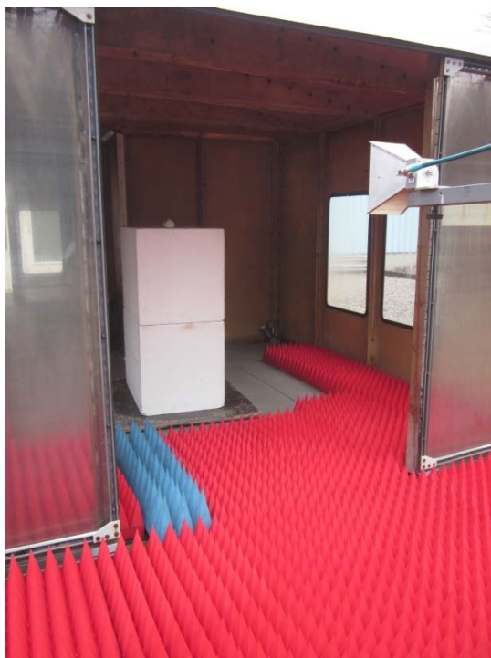
Horizontal Antenna Polarization, 1 GHz to 12 GHz, Double Ridge Guide Antenna