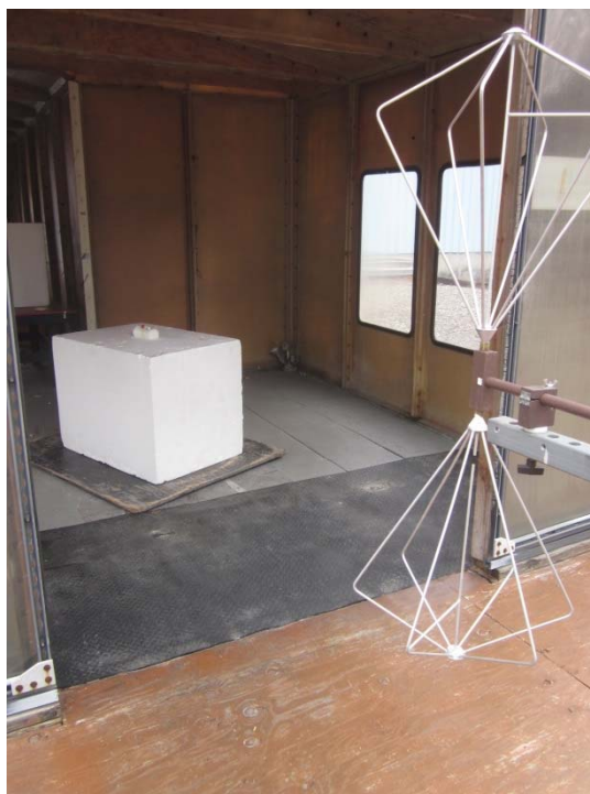
Vertical Antenna Polarization, 30 MHz to 200 MHz, Biconical Antenna