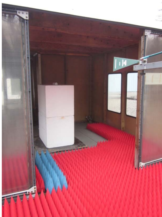
Horizontal Antenna Polarization, 12 GHz to 18 GHz, High Gain Horn Antenna