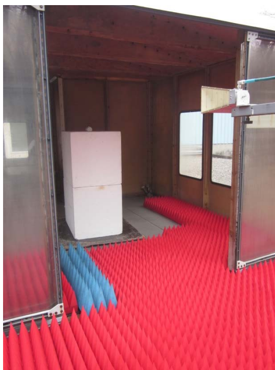
Vertical Antenna Polarization, 1 GHz to 12 GHz, Double Ridge Guide Antenna