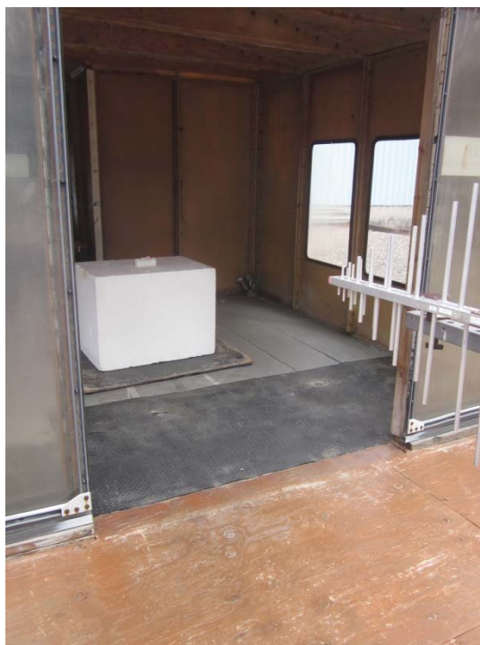
Vertical Antenna Polarization, 200 MHz to 1 GHz, Log Periodic Antenna