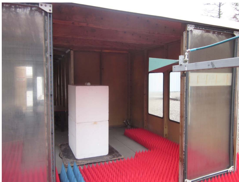
Vertical Antenna Polarization, 12 GHz to 18 GHz, High Gain Horn Antenna