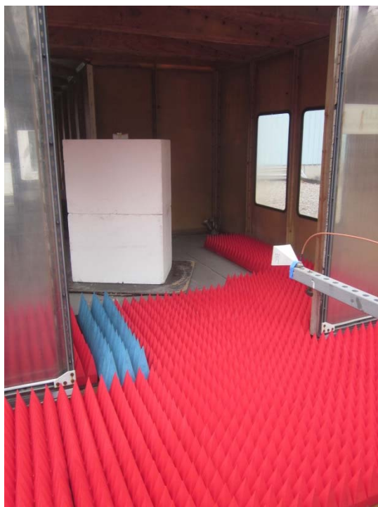
Vertical Antenna Polarization, 18 GHz to 25 GHz, Horn Antenna