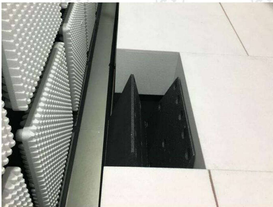
Radiated spurious emission Test Setup-3(Above 1GHz) There are absorbing materials under the ground.