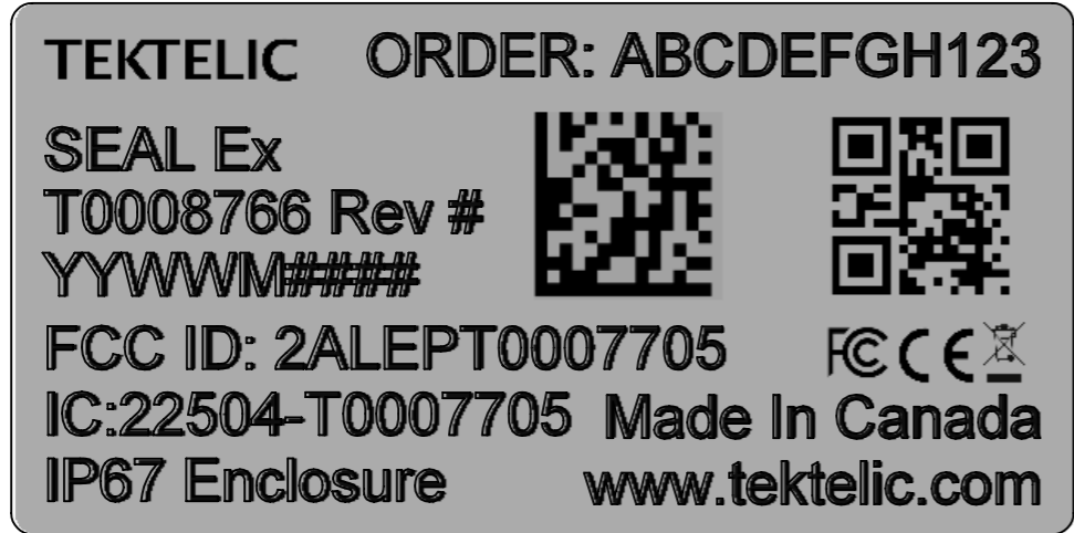
MODULE, SEAL Ex