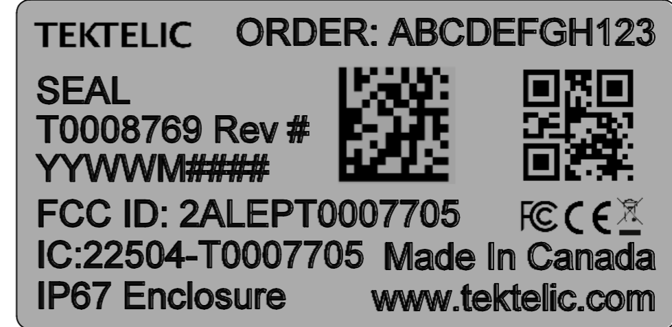
MODULE, SEAL, CLIP SAFETY