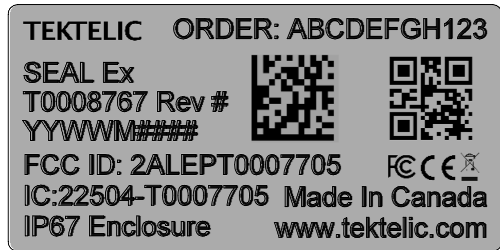
MODULE, SEAL Ex, CLIP SAFETY