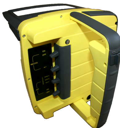
Figure 2: Recco detector rear view