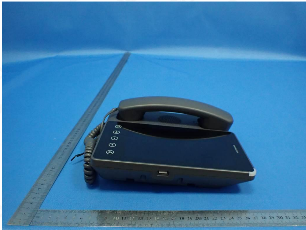
PORT VIEW OF EUT-1