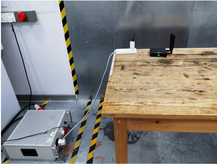
Emissions in frequency bands (below 1GHz)