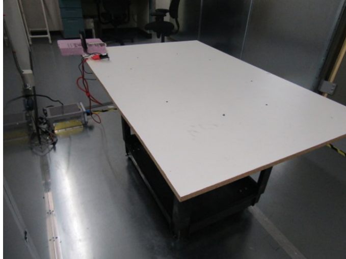
Figure 5: Power Line Conducted Emissions – Side View