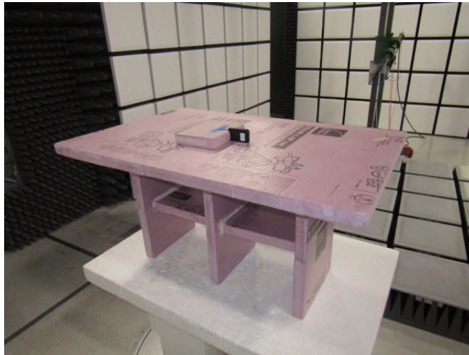
Figure 1: Radiated Emissions – Above 1GHz – Rear View