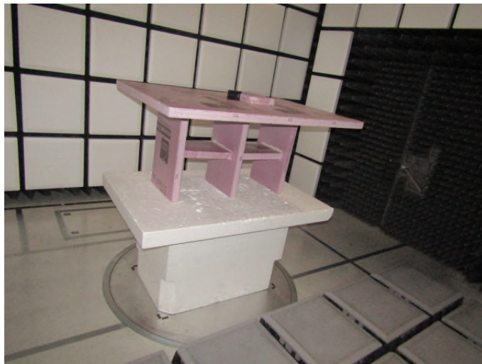
Figure 2: Radiated Emissions – Above 1GHz – Front View