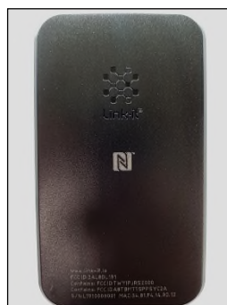
Figure 3: Host – Back