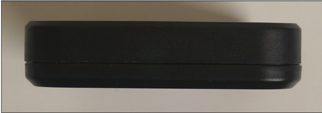
Figure 4: Host – Top