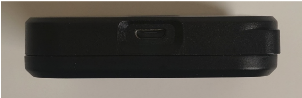
Figure 5: Host – Bottom