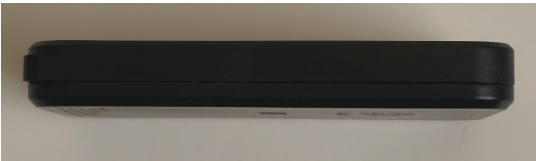
Figure 6: Host – Right Side