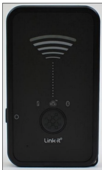
Figure 2: Host – Front