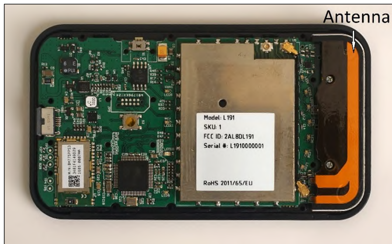
Figure 1: Module mounted in Host