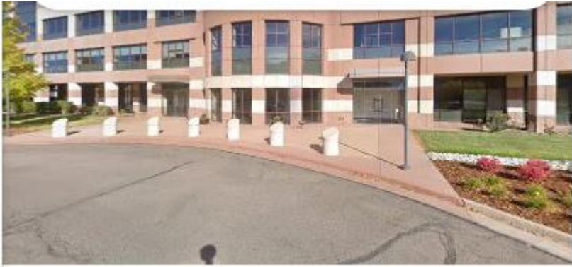
7595 Technology Way