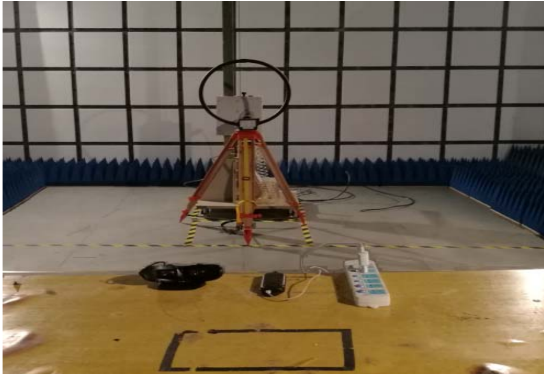
Radiated emission 30MHz~1GHz