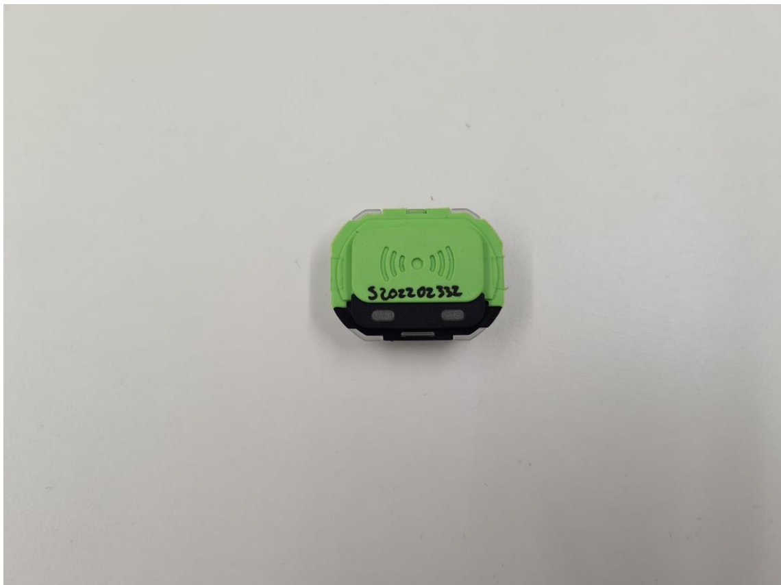
Figure 1: Sample for radiated measurements