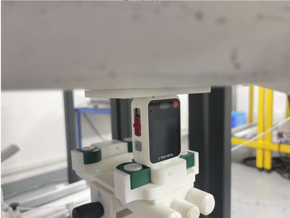
Edge 2 (Right) 5mm