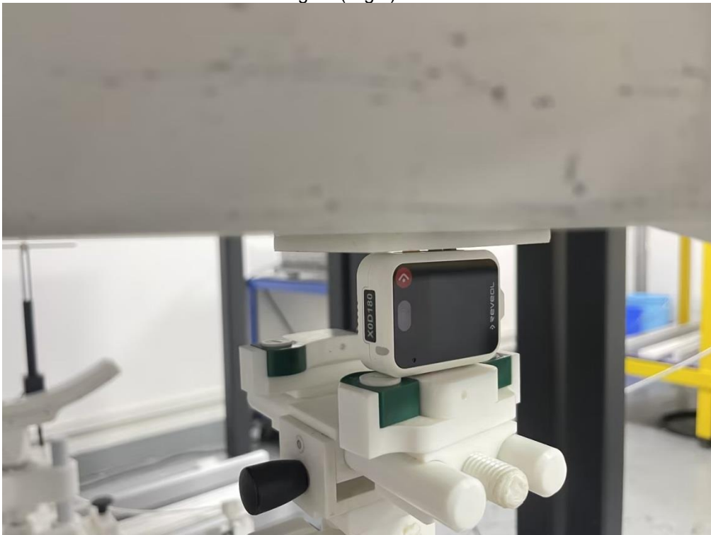
Edge 3 (Bottom) 5mm

Any report having not been signed by authorized approver, or having been altered without authorization, or having not been stamped by the “Dedicated Testing/Inspection Stamp” is deemed to be invalid. Copying or excerpting portion of, or altering the content of the report is not permitted without the written authorization of AGC. The test results presented in the report apply only to the tested sample. Any objections to report issued by AGC should be submitted to AGC within 15days after the issuance of the test report. Further enquiry of validity or verification of the test report should be addressed to AGC by agc01@agccert.com .